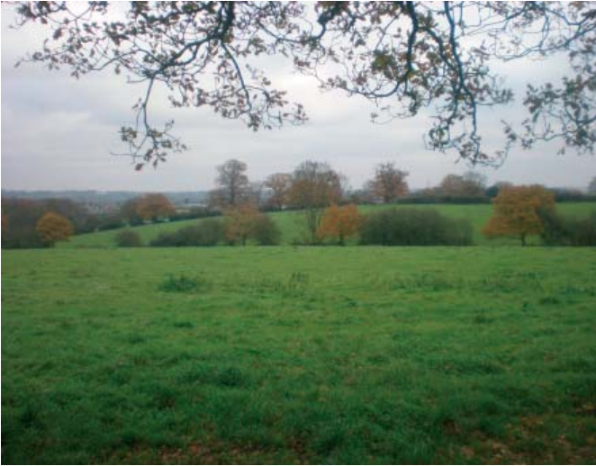
Gently undulating landform with occasional long views out to the Colne Valley,.