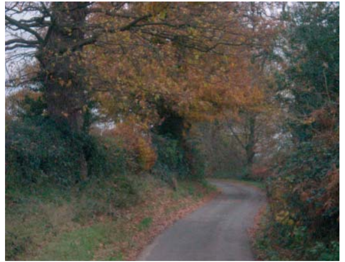
Small roads have a rural character enclosed by woodland and tree cover.