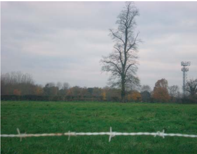
Fields of rough grazing with wire fencing with wooded boundaries.