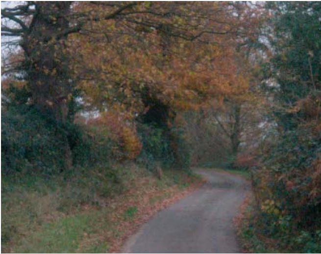
Small winding rural roads and lanes often enclosed by tall hedgerows and trees.