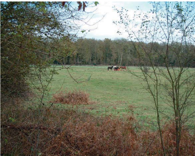
Varying degrees of enclosure with open farmland enclosed by pockets of woodland.