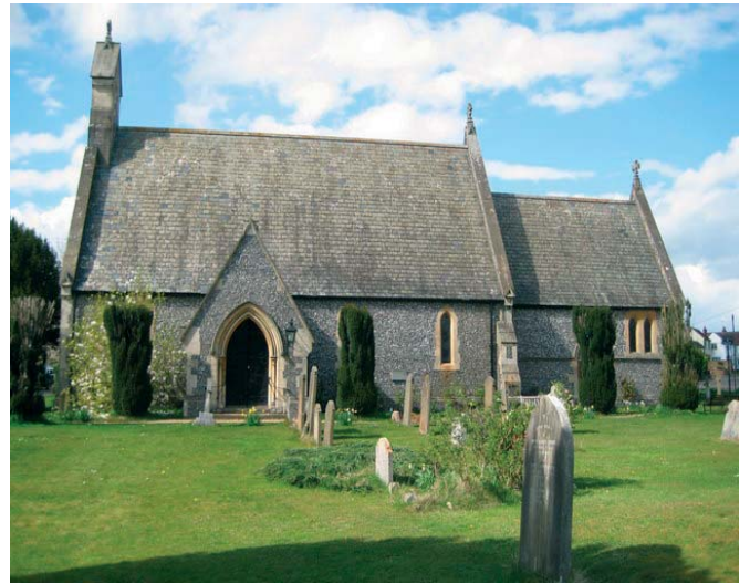
Seer Green Holy Trinity Church Grade II Listed Building, with knapped flint and stone dressings.