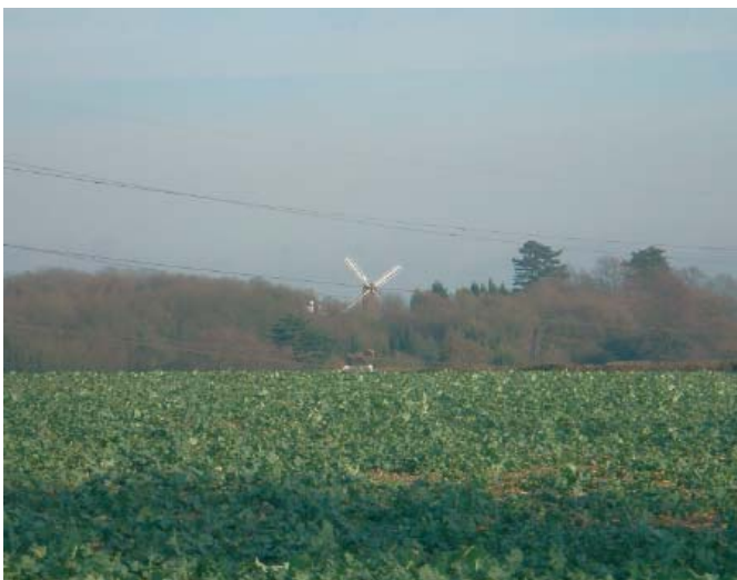
View across arable farmland to windmill, a distinctive feature in the landscape.