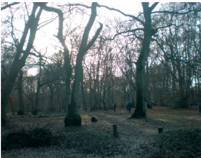
Dense, mature block of woodland, used for recreation.