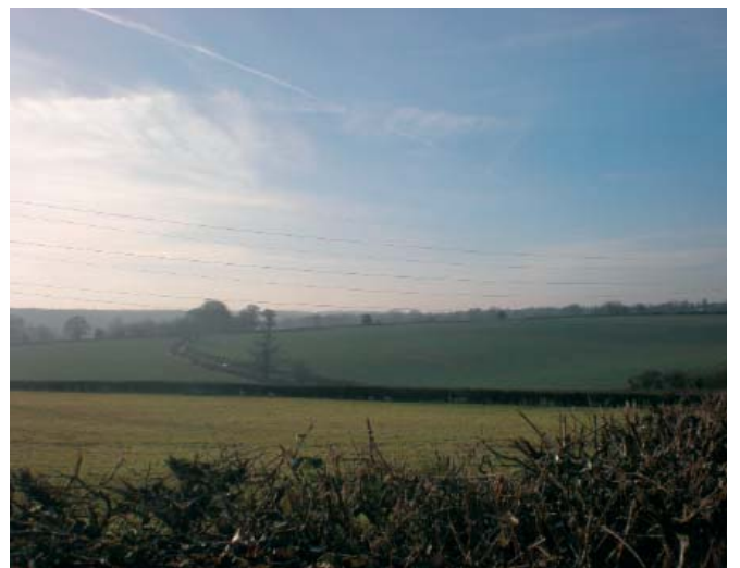
Occasional long views across open fields..