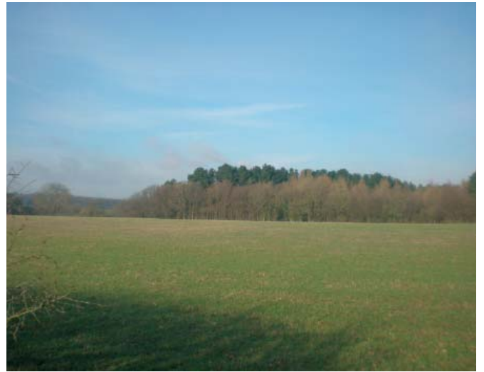
Woodland often forms the backdrop to fields, with a rich texture, created by the mix of deciduous and coniferous trees.