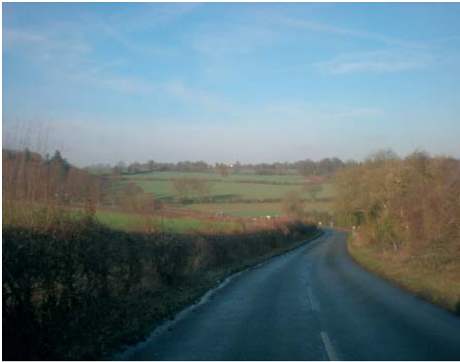
Gently rolling landform, with open fields interspersed with blocks of woodland, and defined by a network of hedgerows.