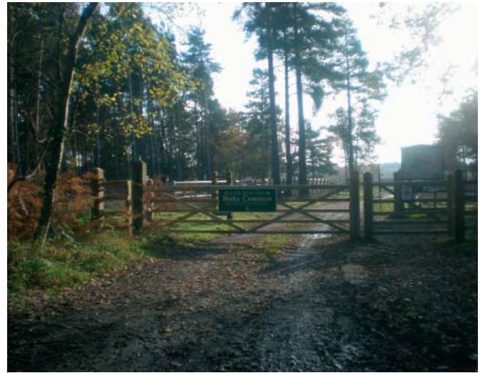
Wooded Stoke Common. Tall trees, with a strong vertical accent, and heathy bracken understory.