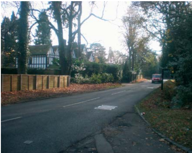
Strong presence of urban elements, interspersed between woodland.