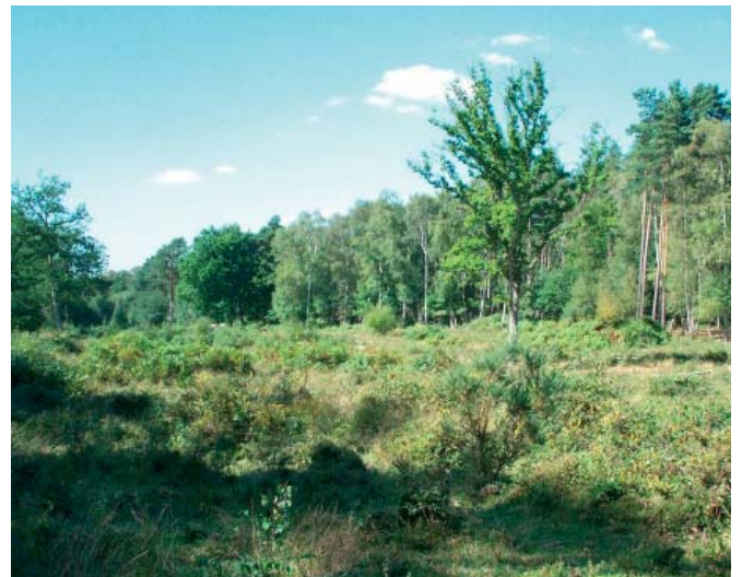
Plantation woodlands and heathland at Stoke Common, creates an enclosed and tranquil character.