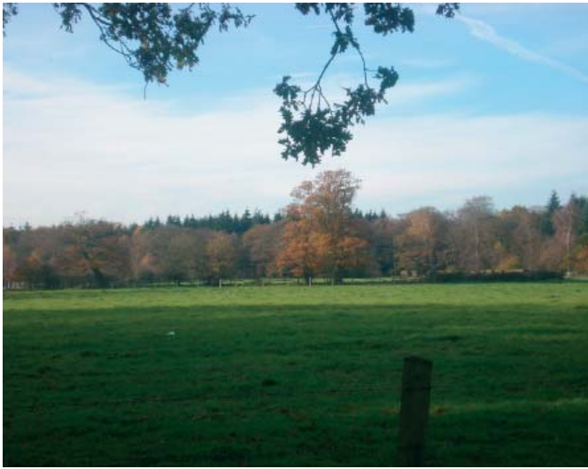
Paddock and rough grazing delineated by woodland, with wooden post & wire field boundaries. Rich Autumn colour.