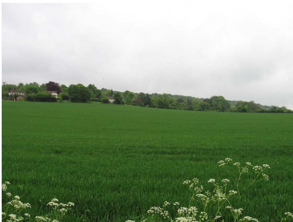
Looking west across a large arable field to the foot of the Chilterns Scarp (LCA 11.1).