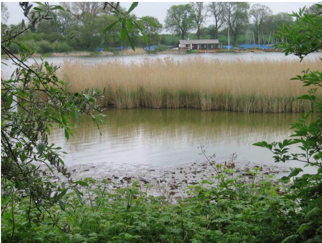
Weston Turville reservoir.

The area has a distinctive transitional character, which describes the change between the vale landscapes to the north and the Chilterns Hills. Overall the sense of place is considered to be moderate. The degree of visibility increases as the land level rises towards the south providing panoramic views over the vale landscape to the north. The overall degree of sensitivity is moderate.