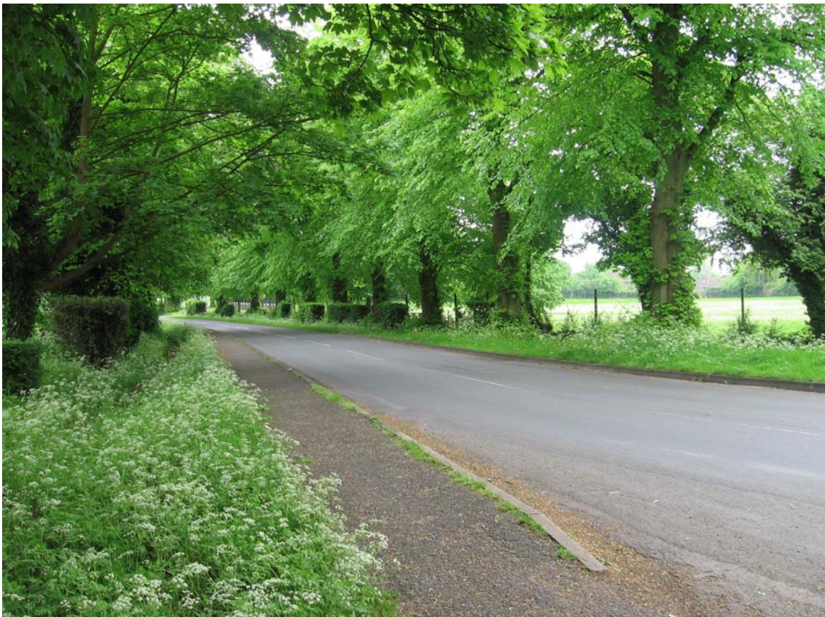
One of several mature avenues at Halton.