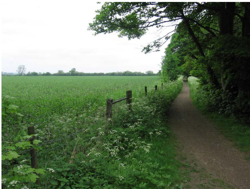
Fields below Halton with canal towpath to the right.