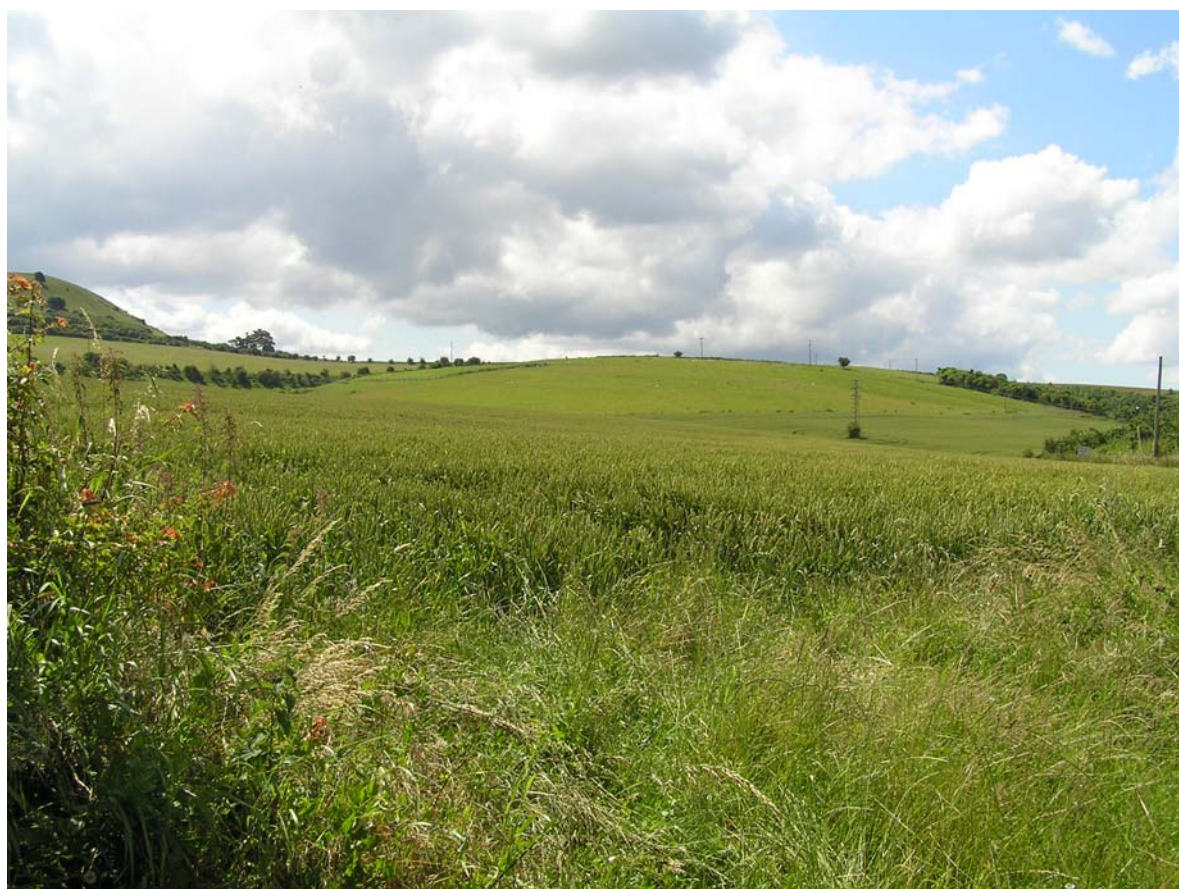
Chalk outlier south of Ivinghoe Aston