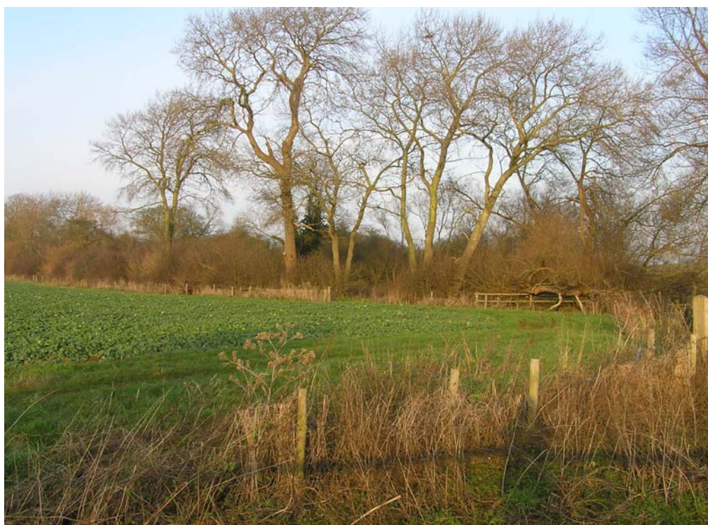
Mature trees adjacent to water course.