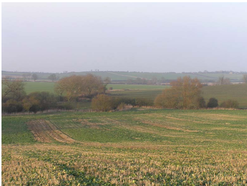
The Kingsbridge Valley looking west.