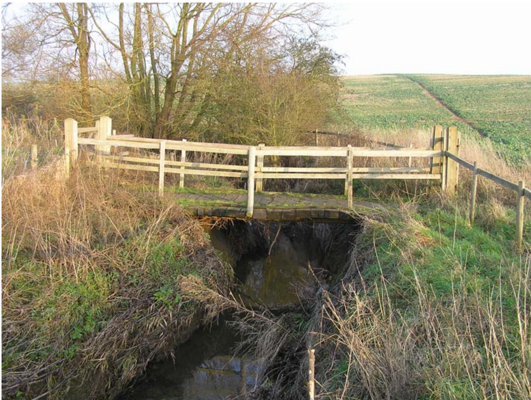
Rustic bridge over stream.

Arable intensification and lack of tree cover have diluted the distinctiveness of the area. Continuity is also dissipated and consequently sense of place is very weak. The dominance of the landscape lies in the landform. The lack of tree cover, other than the willow scrub which follows the stream alignment, ensures high visibility and long distance views across the valley. Overall the sensitivity is considered to be moderate.