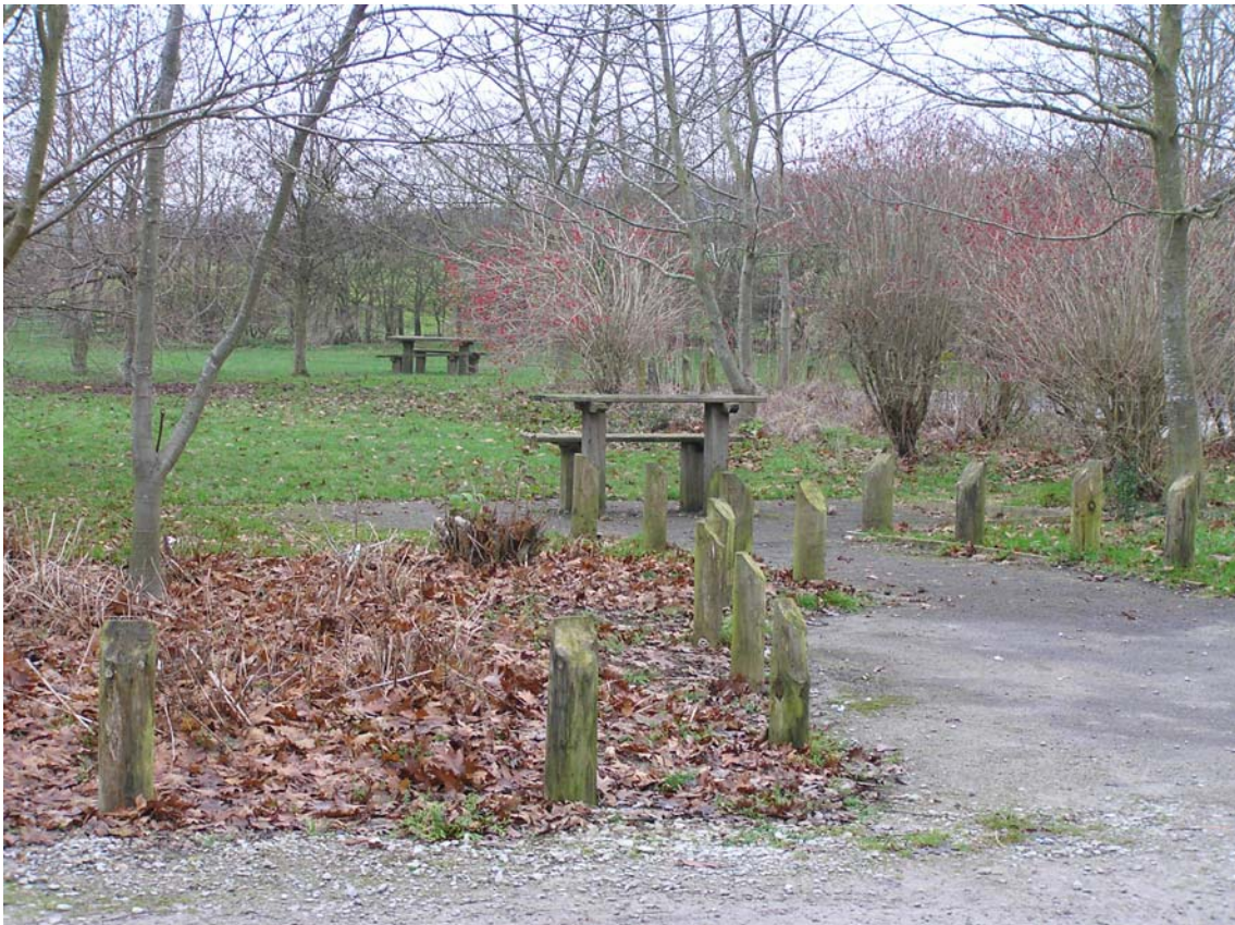
Picnic site at Kingsbridge Farm (Managed by Buckinghamshire County Council).