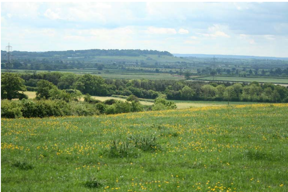
The southern side of the ridge is predominantly woodland and pasture with dramatic views to woodland of the Waddesdon Manor parkland and the Chiltern escarpment on the horizon.