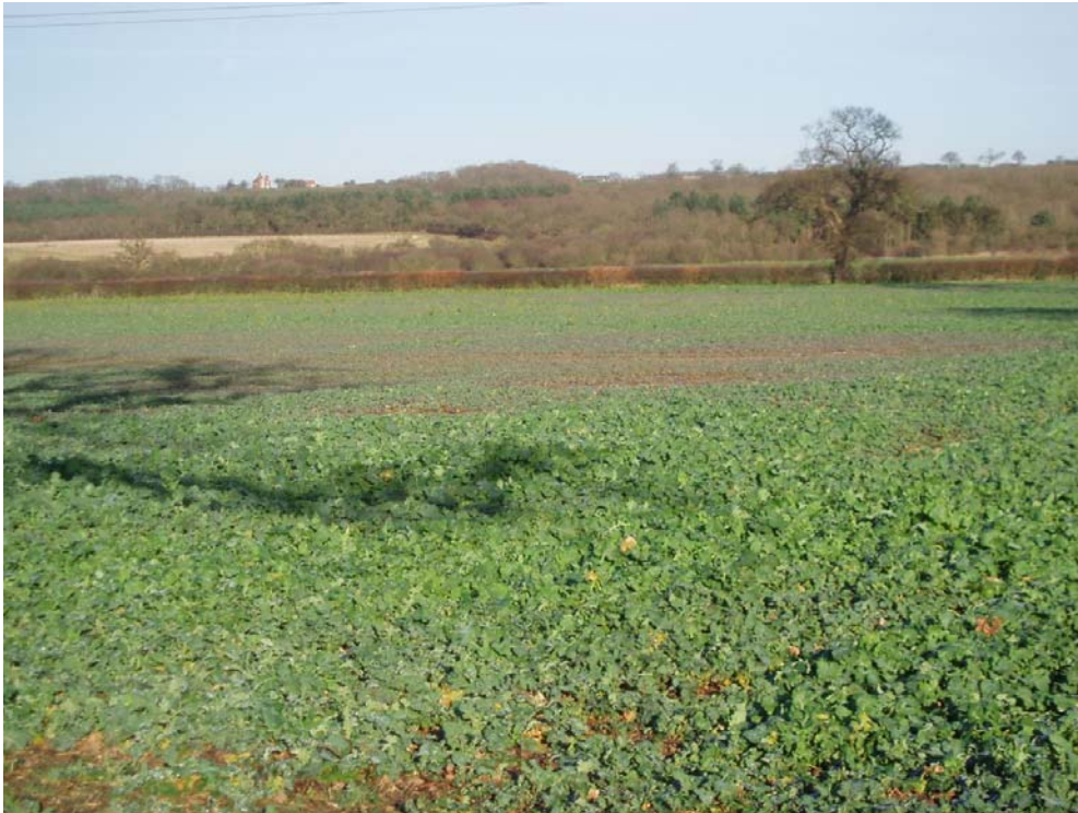
View looking up to Finemere Hill from the south, Finemerehill House is just visible on the left hand side.