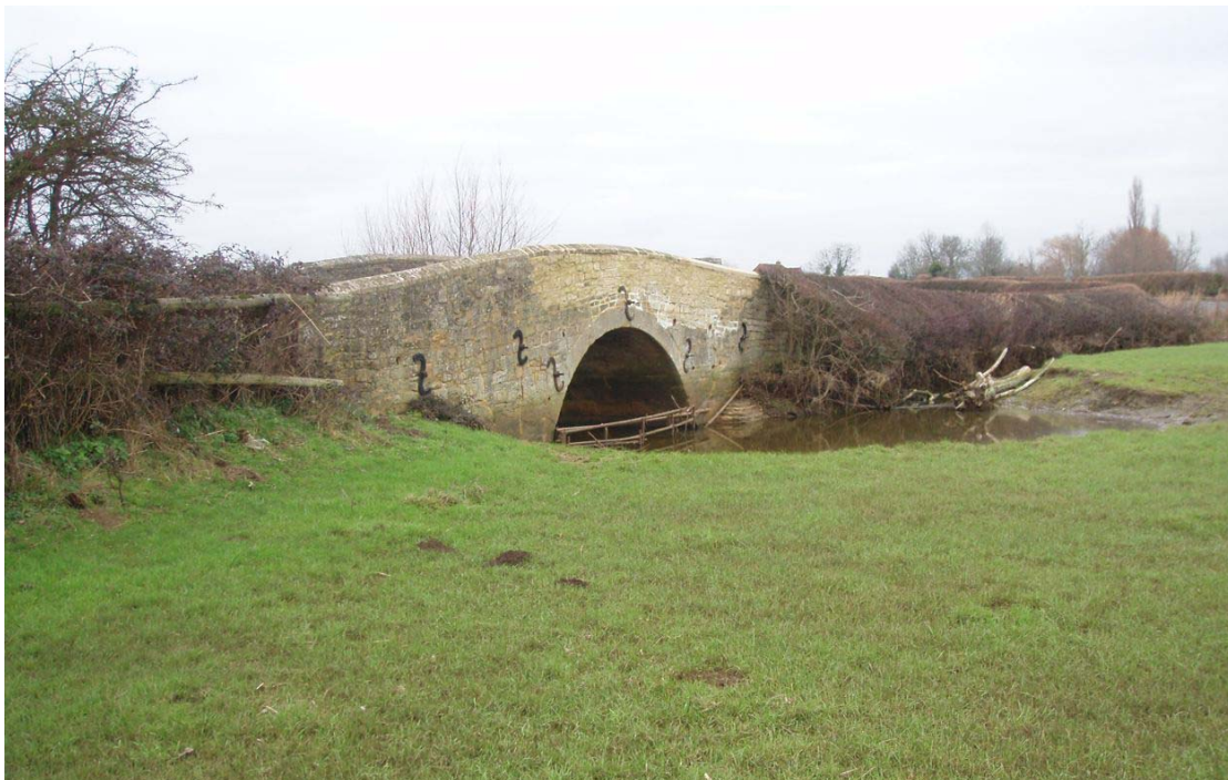
The narrow lanes and stone bridges in the Thame floodplain give a good sense of historic continuity

This area is considered to have a distinctive landscape character and a historic sense of continuity. This combines to give the area a moderate sense of place. The gently sloping landform is considered to be apparent in that the very gently sloping character of the landform is a distinctive feature of the area the tree cover is considered to be intermittent as there is a very low level of woodland cover and tree cover along hedgerows is variable giving a moderate level of visibility. The combination of a moderate landscape character and a moderate level of visibility combine to produce an area with a moderate level of sensitivity.