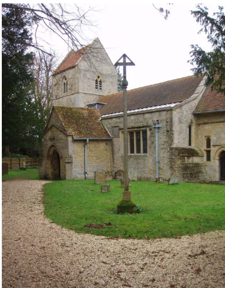
Both Ickford Church and Worminghall church are key features in views between the two villages.