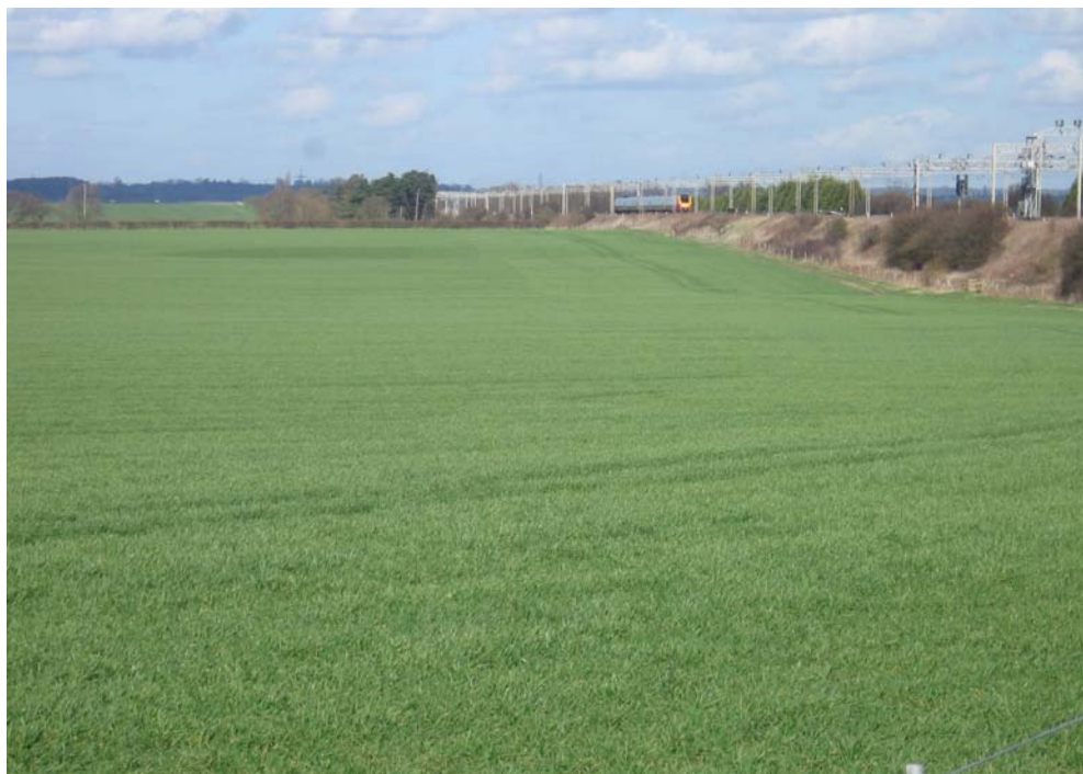
Grassland to the west of the west coast mainline railway.