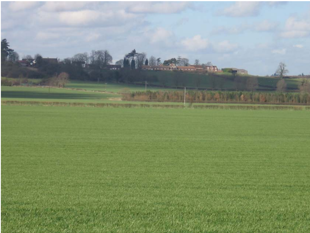
View west from Cheddington Station over large arable fields with clipped hedgerows.

Sense of place is weak, suffering from loss of field pattern and lack of distinctiveness. Landform is insignificant and tree cover is poor. In the north, much of the character is derived from the strength of the parkland which lies on the ridge that defines the northern boundary but which lies outside the area. The other boundaries to the area lack distinctiveness. Visibility is moderate due to the open nature of the area. Overall the degree of sensitivity is low.