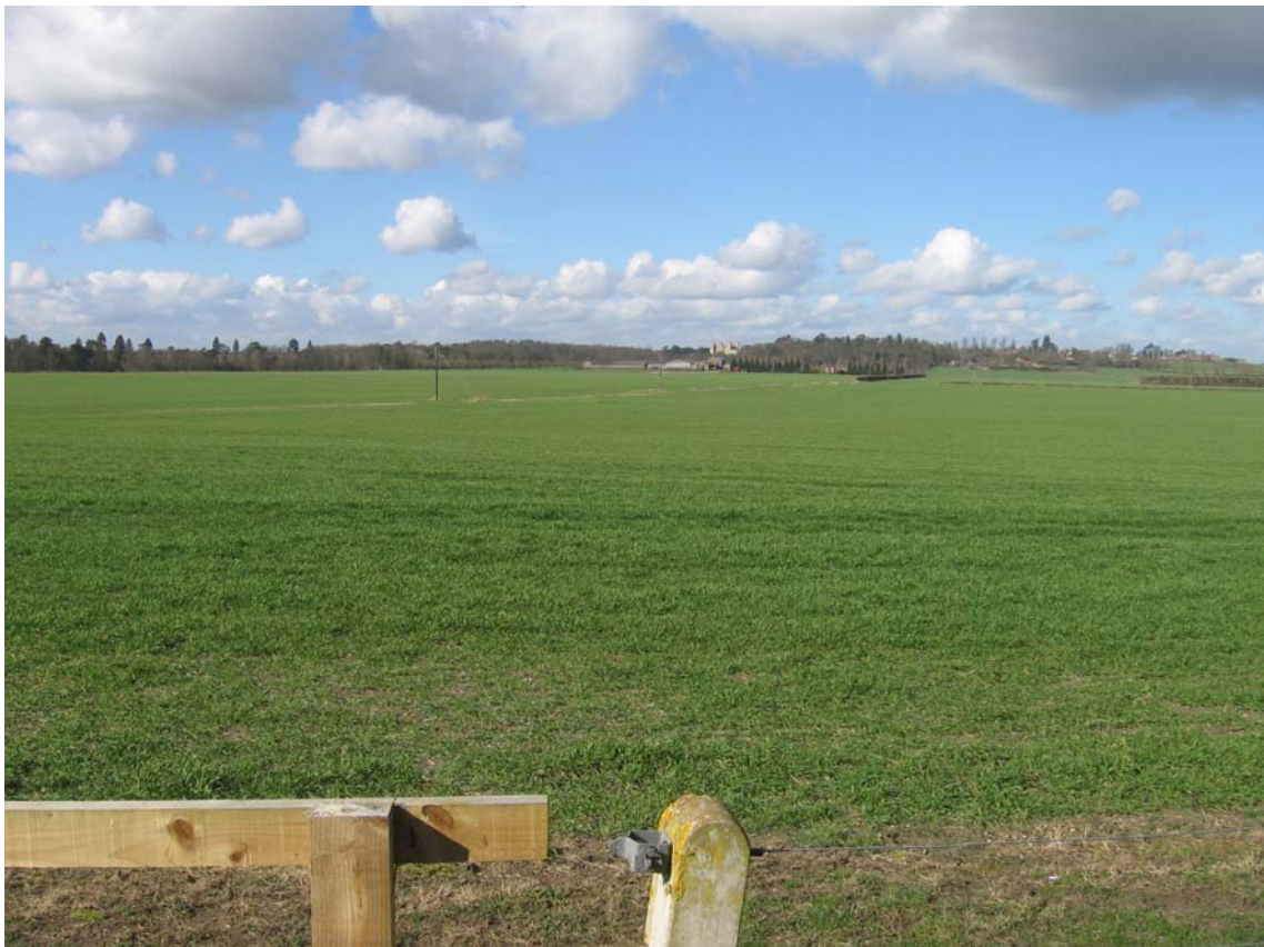
Large arable field between Cheddington Station and Mentmore Ridge.