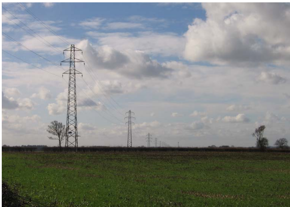
Vale landscape looking west from Cheddington crossroads.