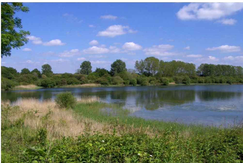
Jubilee Lake Nature Reserve seen from the Crispin Fisher Bird Hide.