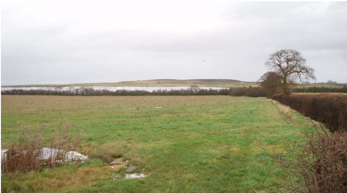
The raised landform of the Calvert landfill.

The landscape has a distinct character but a lack of historic continuity with many of the landscape features being recent. This gives the area a generally weak sense of place. The landform is considered to be apparent although this primarily reflects the new hill from the landfill operations. The tree cover is intermittent being strong around the lakes but weak in the south of the area. The visibility overall is moderate. The area as a whole is given a low sensitivity rating.