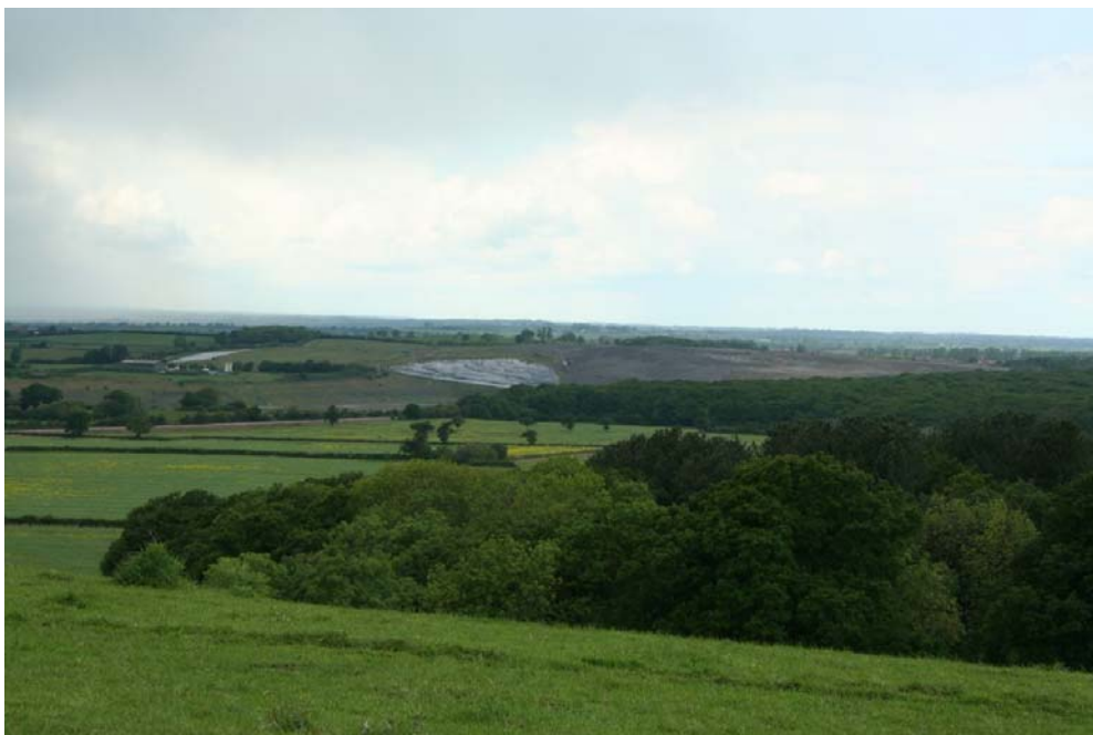
Calvert landfill seen from higher ground of Finemere Hill in LCA 9.1 to the northeast.