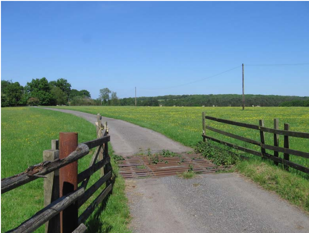
Large paddock within a woodland setting adjacent to Cherry Orchard Farm.

The area is distinguished by its elevation over the surrounding areas and extent of woodland cover. Historic continuity is supported by moderate sense of place. Due to the elevated nature of landform the area dominates its surroundings, made more prominent by the mature woodland cover. Although the tree cover is concentrated around the Stockgrove area it is sparse in the north where there are large open arable fields thus rating woodland cover as intermittent. Visibility is high particularly from the fringes of the area where there are long distance views over surrounding areas. Overall the degree of sensitivity remains high.