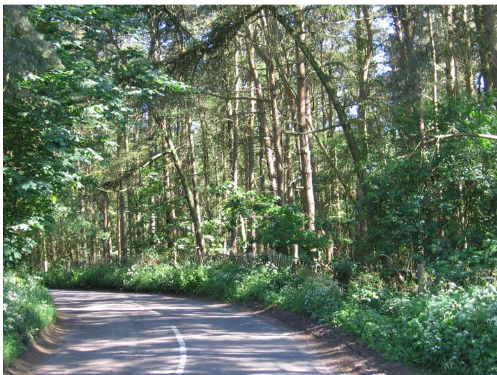
Scots Pine woodland on Heath Road.