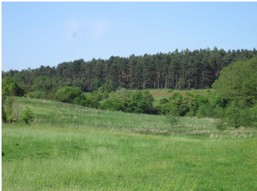
Conifer woodland north of Kiln Farm.