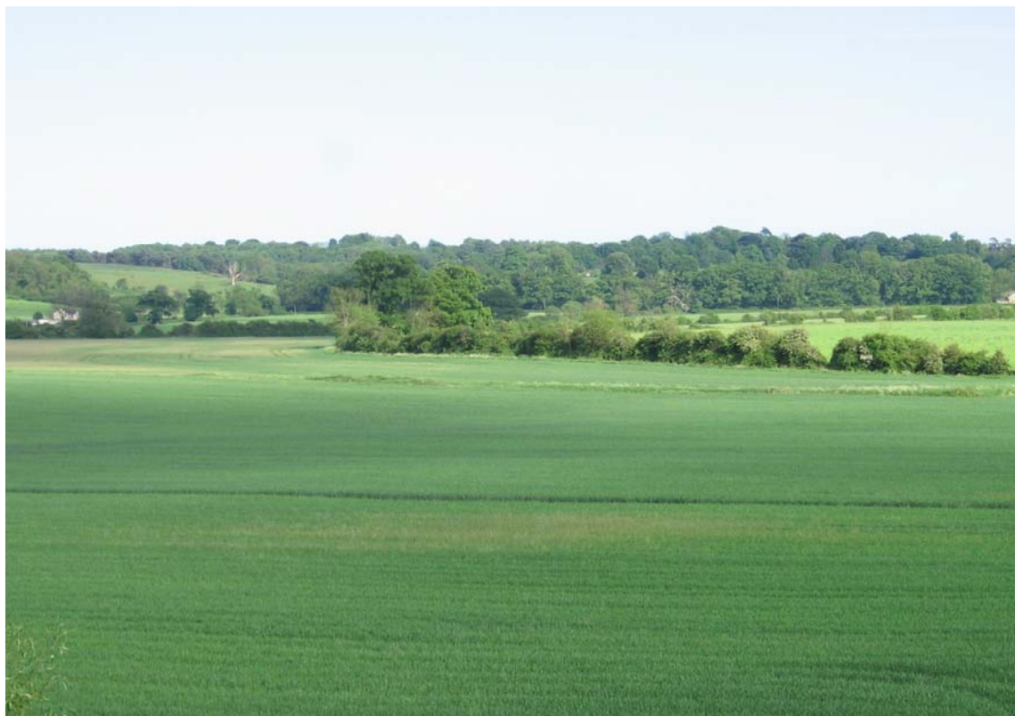
View of Brickhills Scarp from the A4146 Galley Lane.