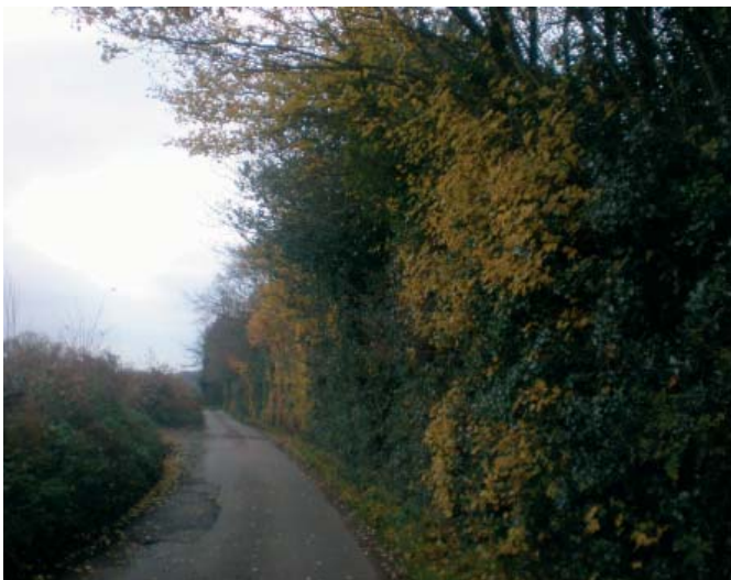
Tall, dense hedgerows, along roads, providing varying enclosure and openness.