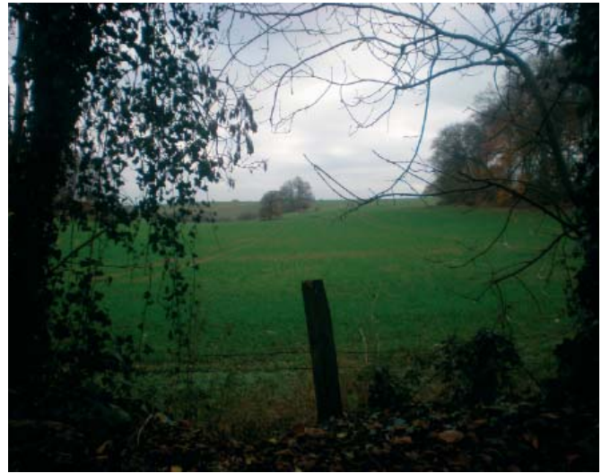
Undulating fields, scattered trees, and wooded enclosure.