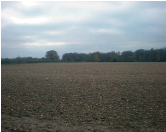
Open, expansive, flat arable farmland, with wooded backdrop.