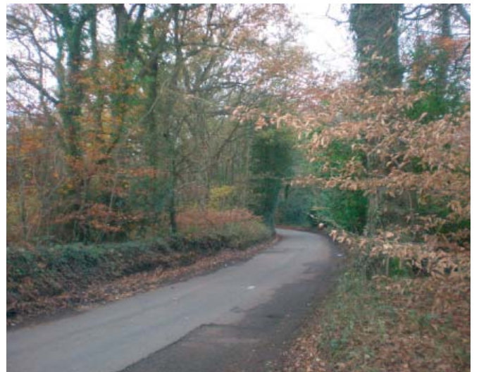
Woodland enclosure along winding rural roads.