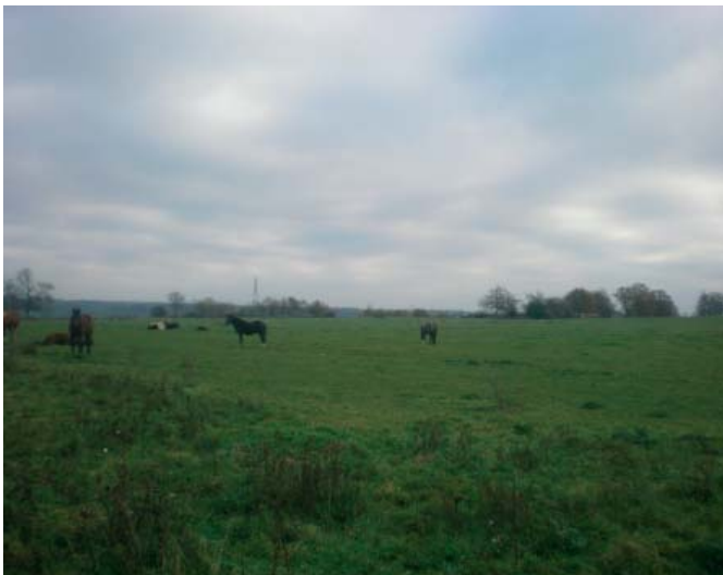
Rough grazing, gappy hedges and scrubby boundaries.