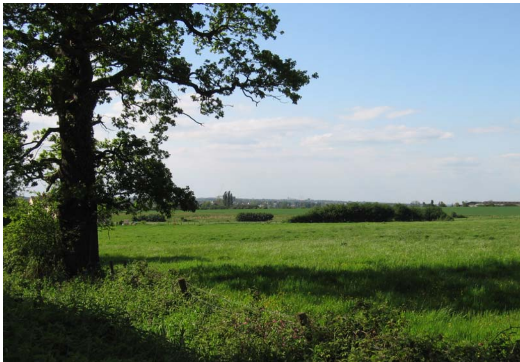
Galley Lane looking north toward the urban fringe of Milton Keynes.