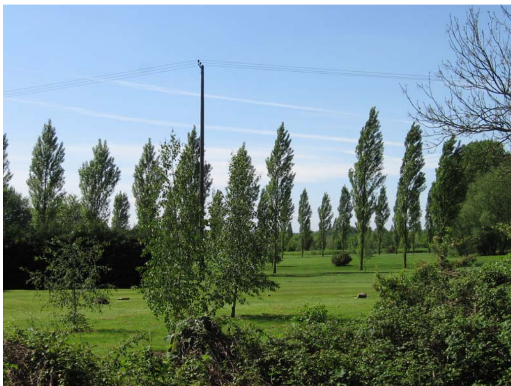
Golf course at the southern end of the area includes distinctive planting of poplars.