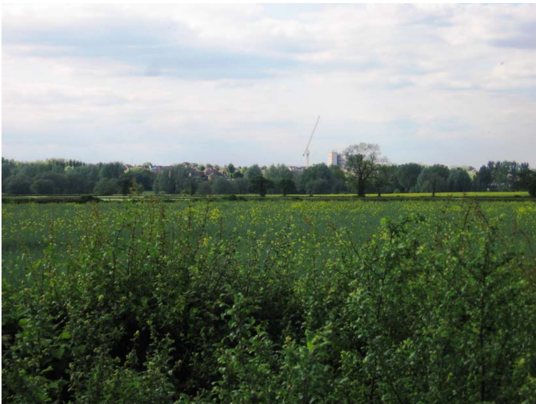
Looking north from the A4146 towards the suburban fringe of Milton Keynes.

The area's distinctiveness has been dissipated through arable intensification and loss of hedgerow trees. Field pattern remains a key feature in a comparatively open landscape. Sense of place is perceived as being weak. The landform which gradually rises to meet the scarp in the east, in conjunction with the lack of tree cover, allows long distance views over the Ouzel Valley and the urban edge of Milton Keynes. Overall the degree of sensitivity remains moderate.