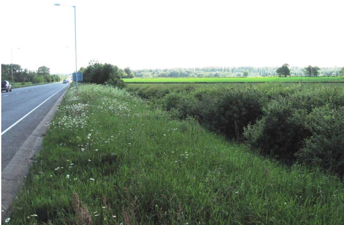
View from the A4146 looking east along the line of the new road.