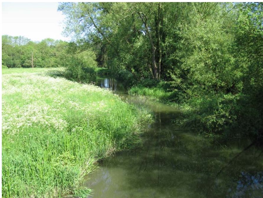
Mature vegetation along the River Ouzel looking south from Stapleford Mill Bridge.