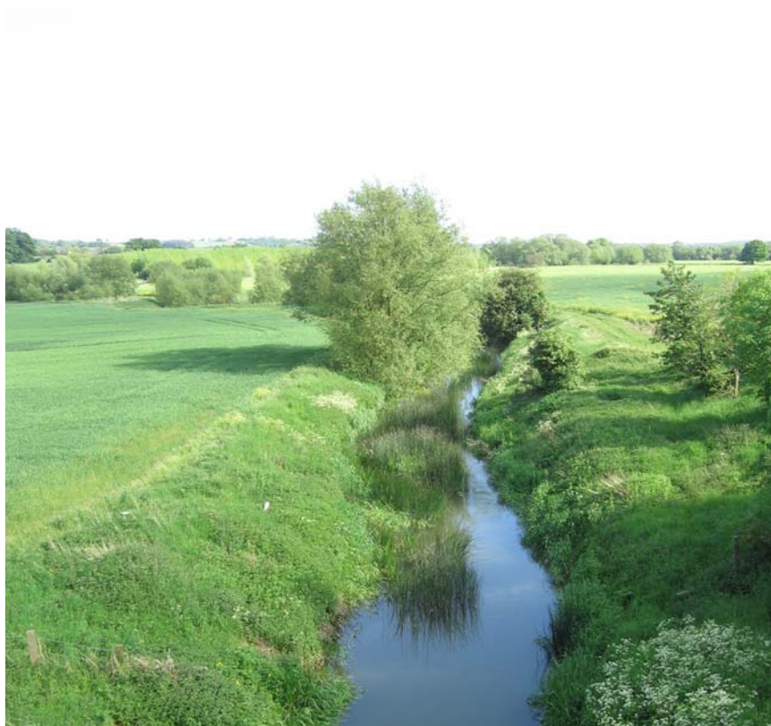
River Ouzel looking south from the A4146.