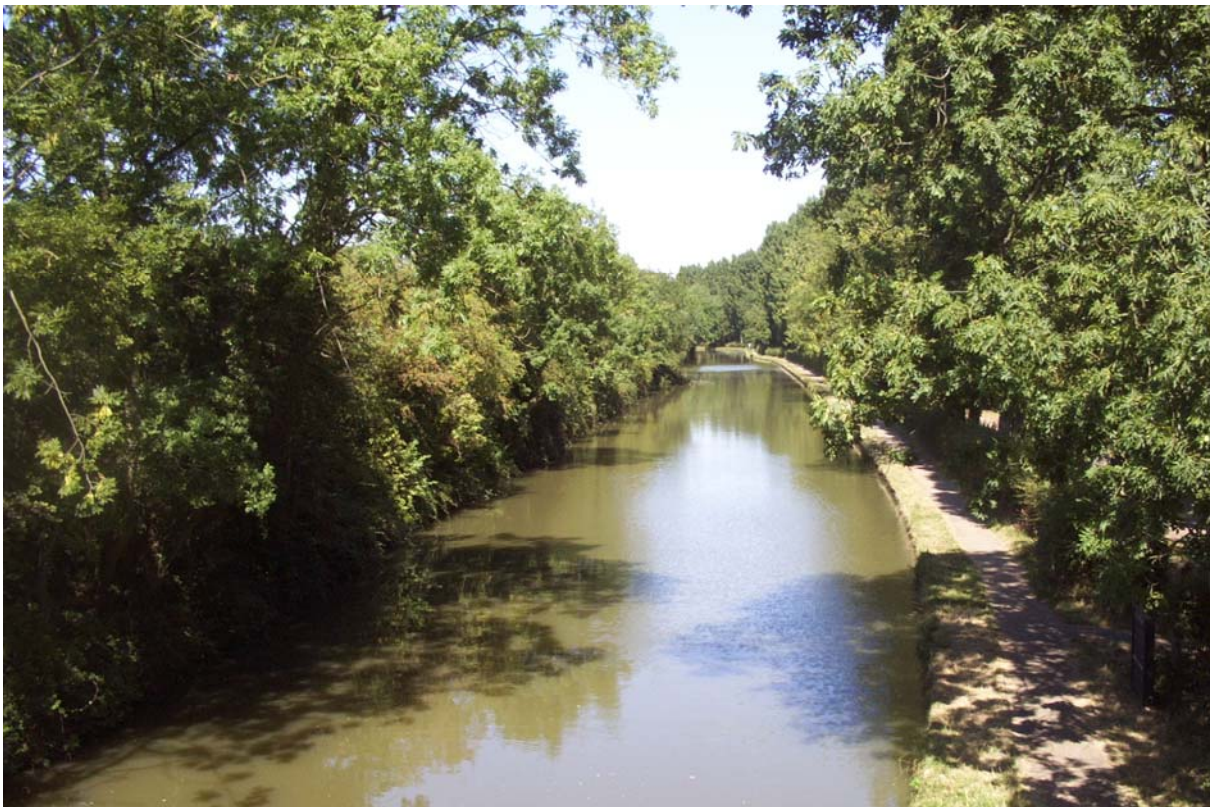
The Grand Union Canal is often hidden by bank side vegetation.

The area is distinguished by the character of the river and canal corridors. There is a strong historic continuity in these features. Overall the area has moderate sense of place. The landform of the valley is apparent becoming a more dominant feature of the landscape beyond the area. The degree of visibility is considered to be low primarily due to the mature tree cover in the valley bottom. This dissipates over the upper slopes. Overall the degree of sensitivity remains low.