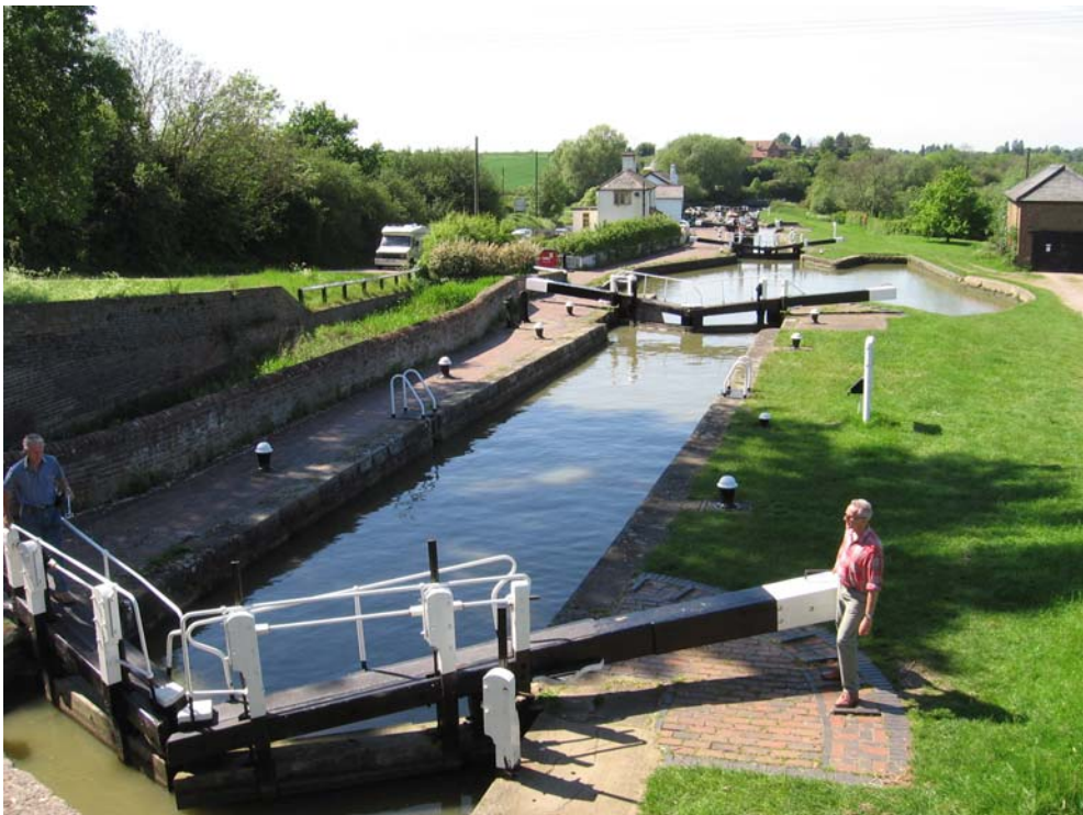
Grand Union Canal Three Locks flight at Stapleford Mill Bridge.