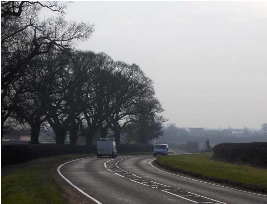
Locally distinctive group of mature oaks on the east side of the A413.

The landscape is distinctive and the historic continuity is well expressed in the field pattern, the organic development of the settlement and the parkland setting to The Lilies. Overall the sense of place is moderate. Topography is an important aspect of the relationship of the village for its surroundings. There is a high degree of visibility with long distance views from the ridge over surrounding countryside. Overall the degree of sensitivity is considered to be high.