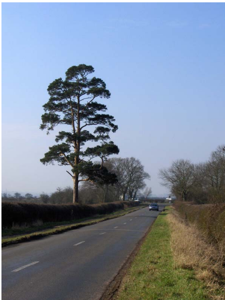
The lone pine on New Road with in the background the copse at the junction with the A413.