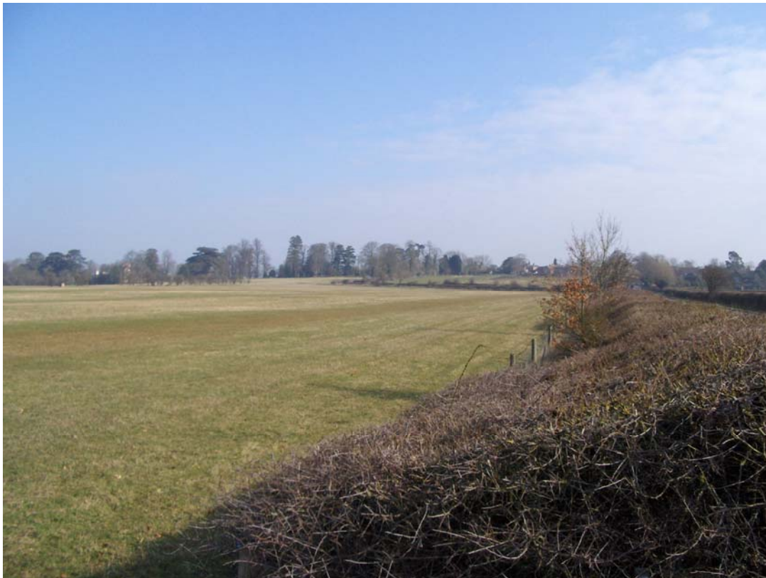
View of Bierton from New Road. The County Showground is on the left of the distinctive thick and well trimmed hedge.