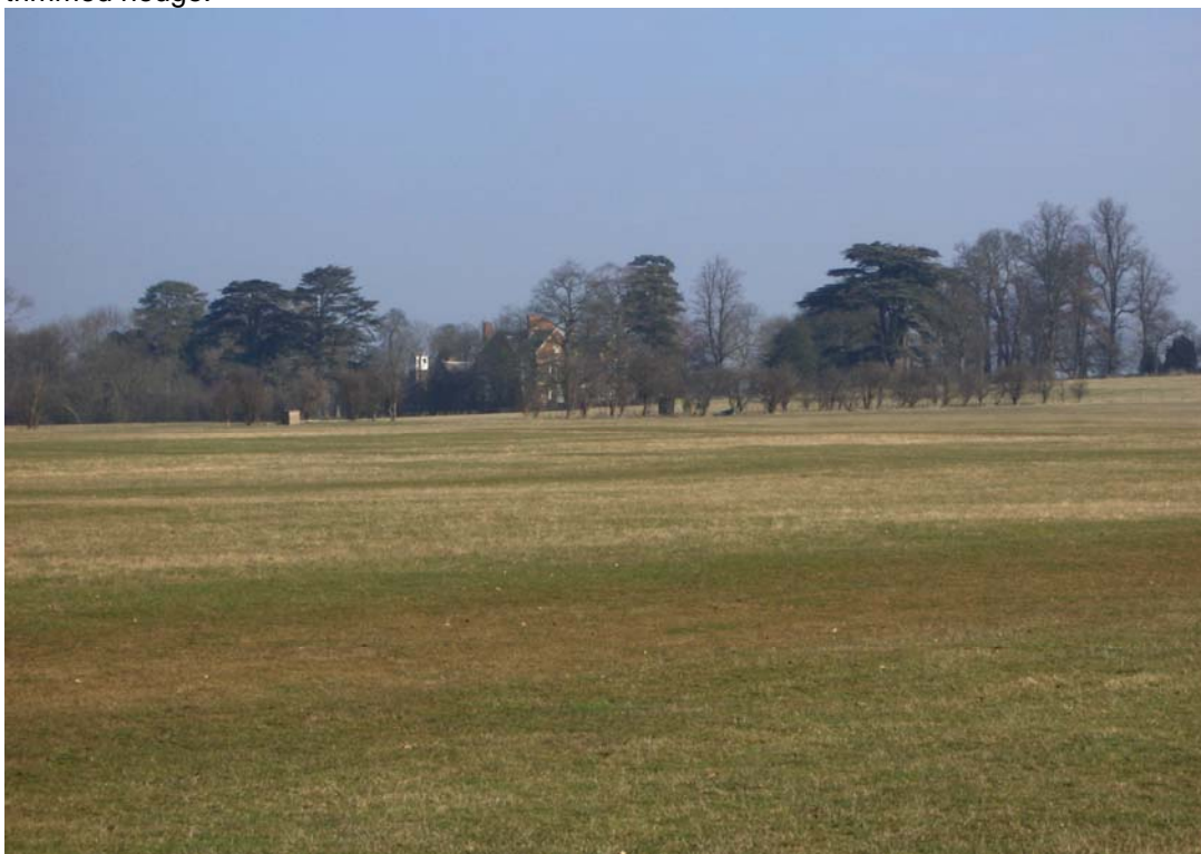
Parkland trees and woodland at The Lillies.