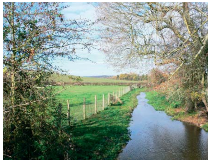
Narrow, gently flowing Misbourne River runs along the valley bottom.