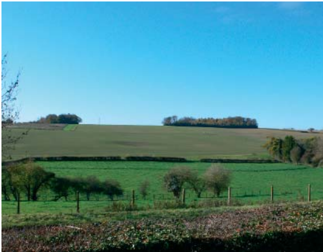
Rough grazing, pasture and paddocks on the valley floor, with arable fields dominating the smoothly rolling valley sides. Woodland blocks situated on higher ground.