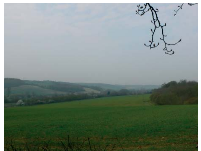
Extensive views from valley sides.