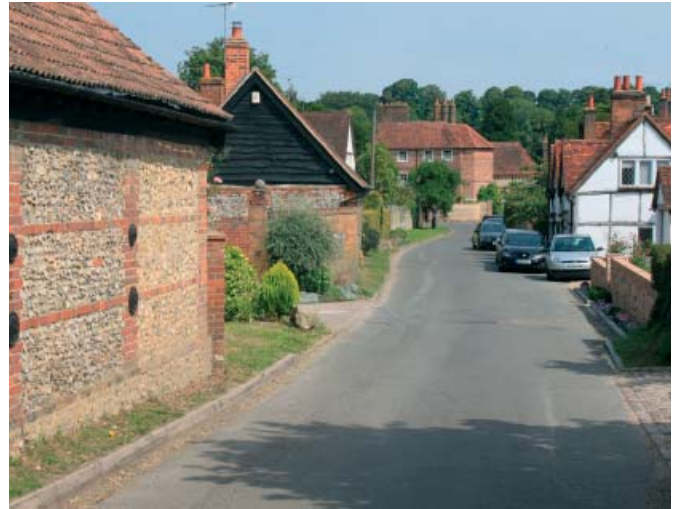
Strong settlement character, with some traditional and historic buildings, such as brick and flint, black wooded cladding and black and white Tudor.