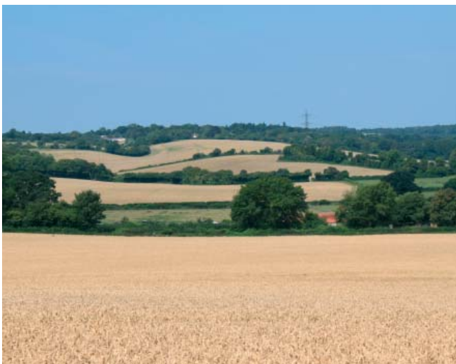
Heavily wooded valley tops contrasting with open fields.