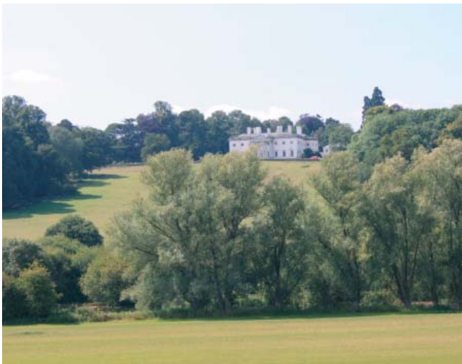
Shardeloes Park and Manor, set amongst park estate land and woodland. A visually prominent landmark on the valley side.