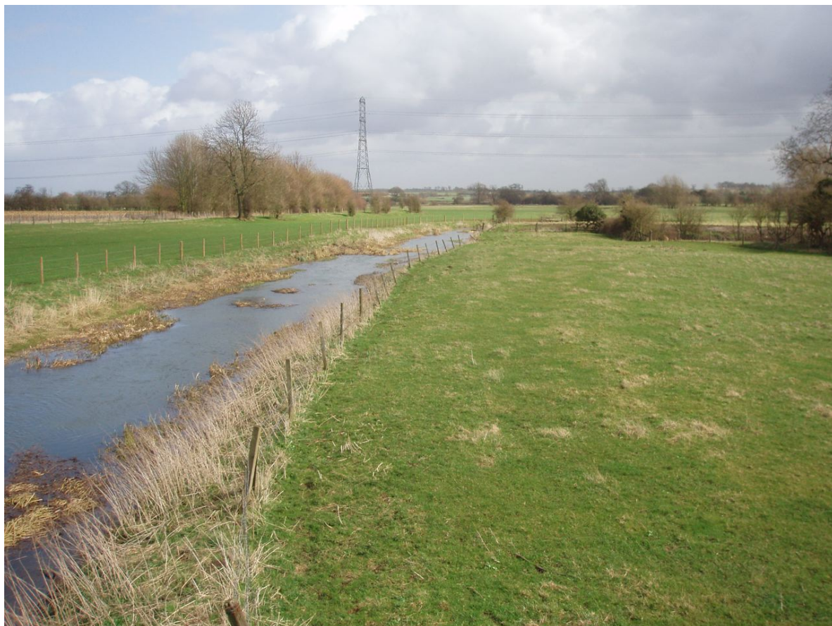
Great Ouse valley looking east showing floodplains adjacent to the meandering river.