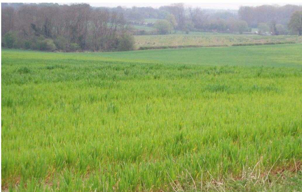
Looking south to the A422 and the Great Ouse valley in the background.