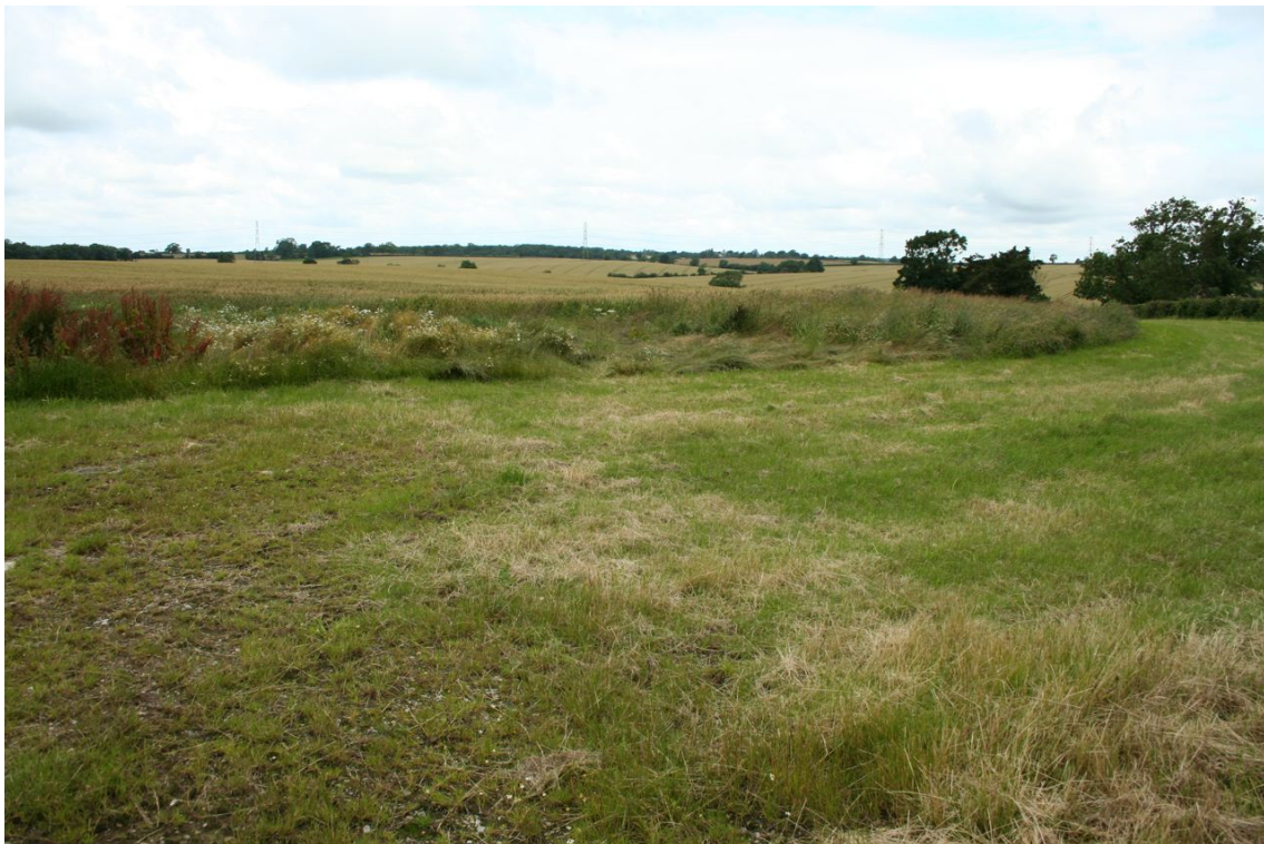
Woodland within adjoining LCAs often defines horizons – here the woodland is in LCA 2.5 Foxcote.

This is a distinct landscape where the remaining hedgerows and narrow lanes give a sense of historic continuity and a moderate landscape character. The tree cover is considered to be open as there is little in the way of woodland and a general lack of hedgerows with trees across most of the area, concentrated close to the stream. The apparent landform and open level of tree cover create a landscape, which is considered to have a high level of visibility. The moderate sense of place and high level of visibility combine to give a landscape of high sensitivity.