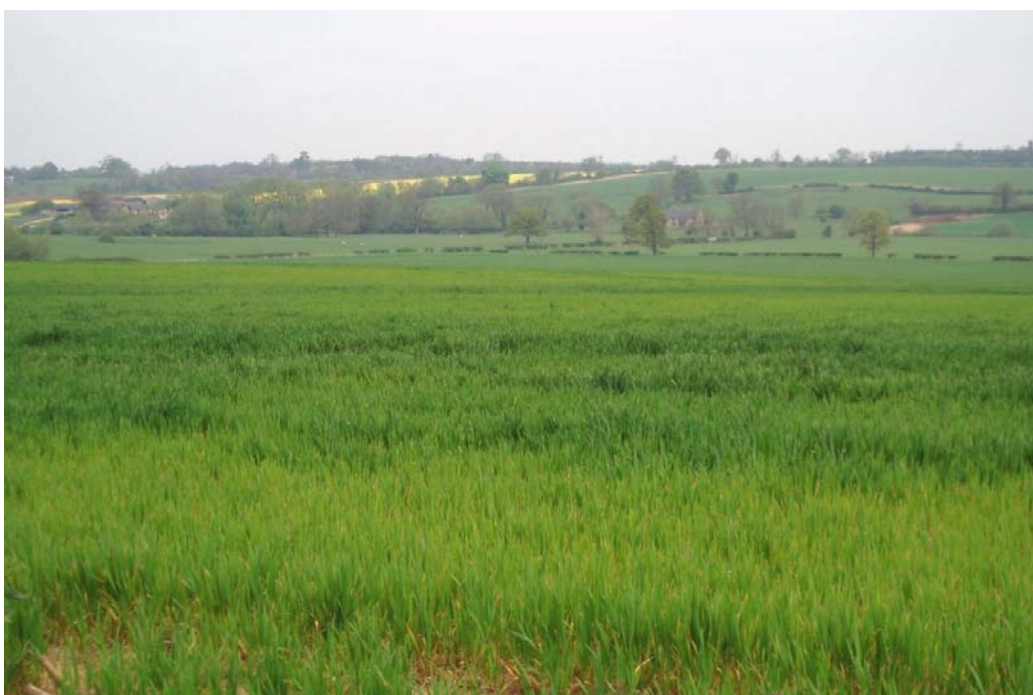
The eastern part showing poor hedgerow pattern in foreground and stream line in the middle distance. The rising ground in the background is in Northamptonshire.