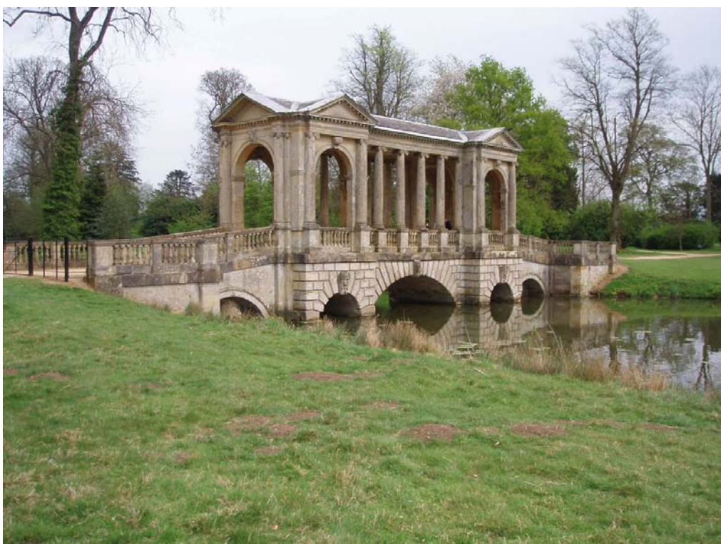
James Gibb designed the Palladian Bridge.