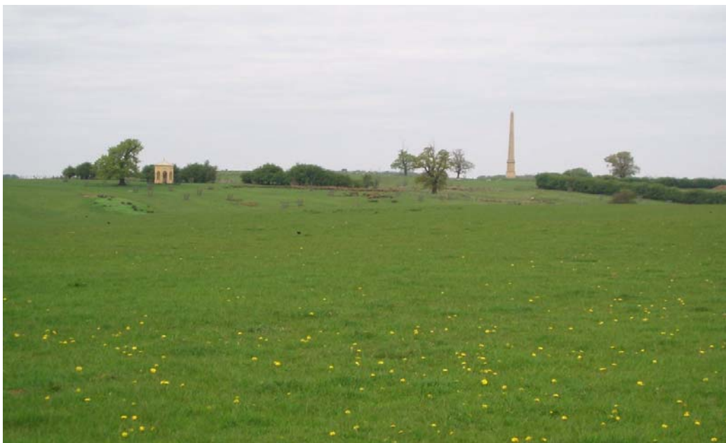
View north towards Wolfe's Obelisk – the area is being restored with new parkland trees.