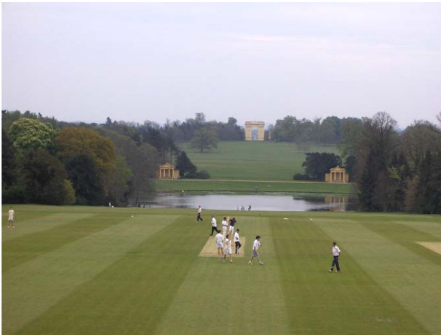
The south vista from the house - the principal axis of the garden since 1676. Once a formal garden the parterres were swept away in the 1740s by Lancelot 'Capability Brown'.

This landscape is considered to be unique being a well-preserved landscape of significant historic importance. It has a strong sense of historic continuity but is also being actively used for 21 st century education, recreation sport and agriculture. The area has a strong sense of place. The landform is apparent and the tree cover is overall considered to be intermittent, which gives a moderate level of visibility although this varies from the enclosed valley landscape of parts of the gardens to the large vistas of the designed parkland. The combination of strong sense of place and moderate visibility combine to make this landscape of high sensitivity.