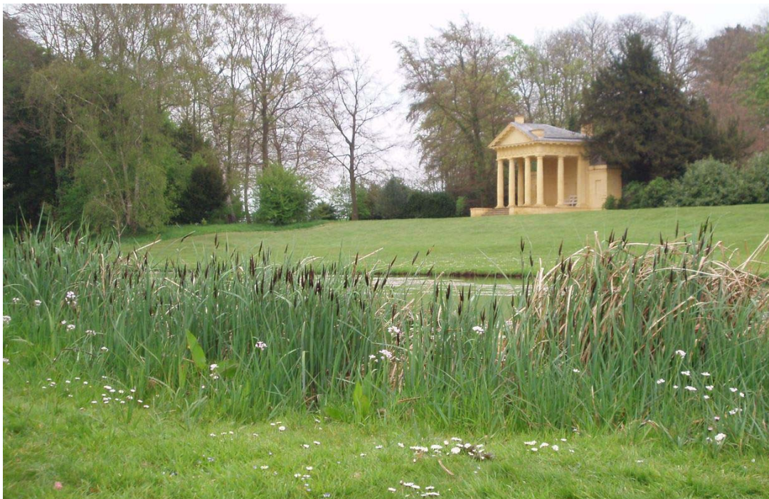
One of two lake pavilions forming part of the south vista and attributed to Vanbrugh.