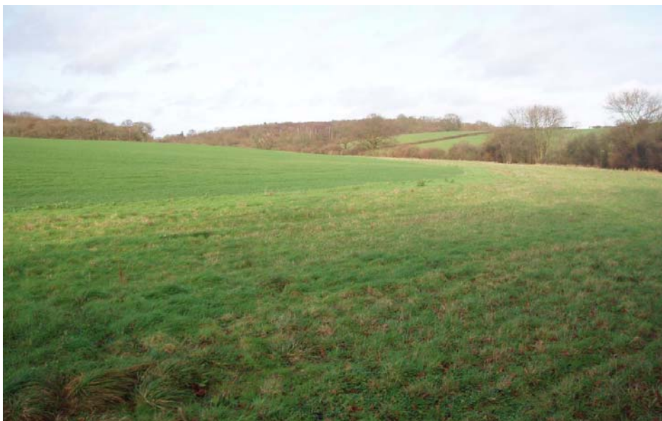
Undulating landform in the west with woodland running up to the Northamptonshire boundary.