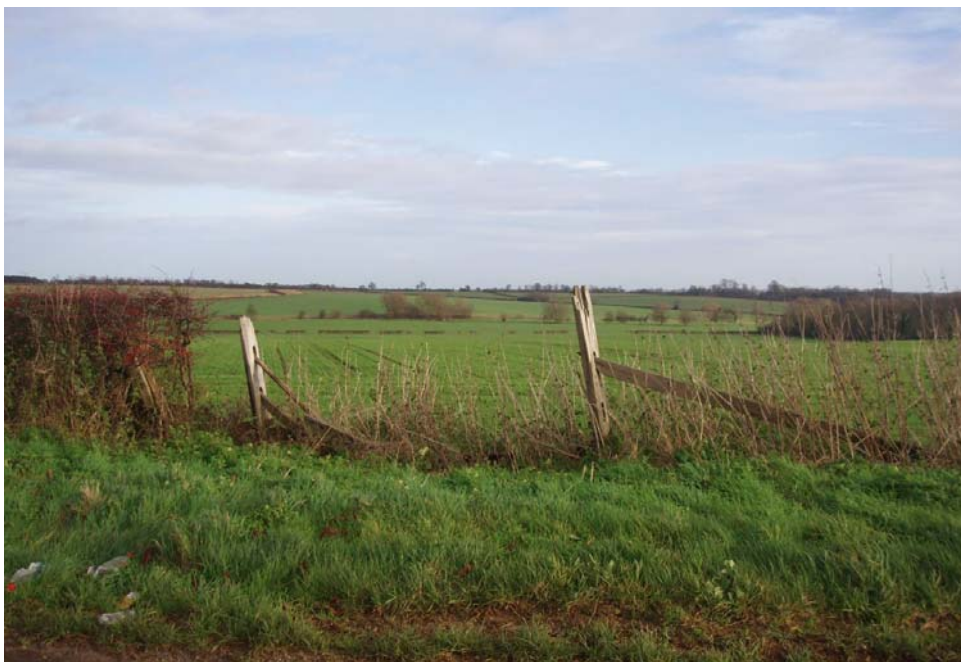
Typically open view of the eastern part showing poor hedgerow structure.