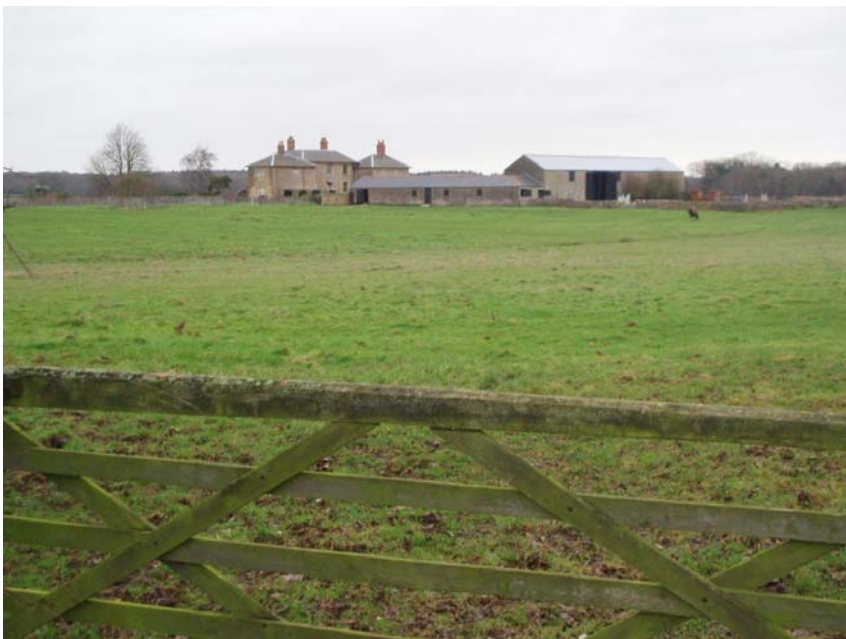
Large isolated farms often on higher ground are a local feature.

The landscape is considered to have a distinct character, which relates to the low level of settlement the open views, the good hedgerow pattern and the woodland. This along with the generally good sense of historic continuity gives the area a moderate strength of place. The landform is apparent and the tree cover generally intermittent varying between areas on the southern edge with open long distance views to the more enclosed intimate areas close to woodland. The apparent landform and the intermittent tree cover combine to give the area a moderate level of visibility. The moderate visibility and moderate strength of place combine to give the area as a whole a moderate level of sensitivity.