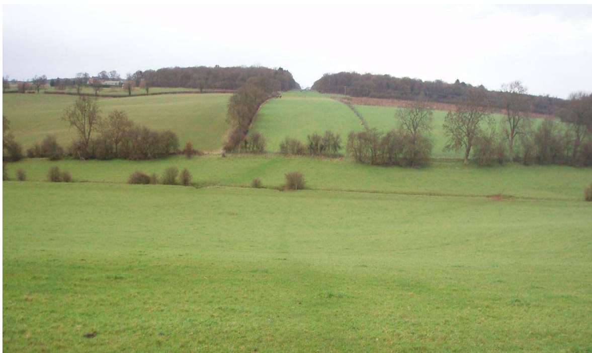
View from the north of Stowe parkland looking towards Silverstone which is screened by woodland.