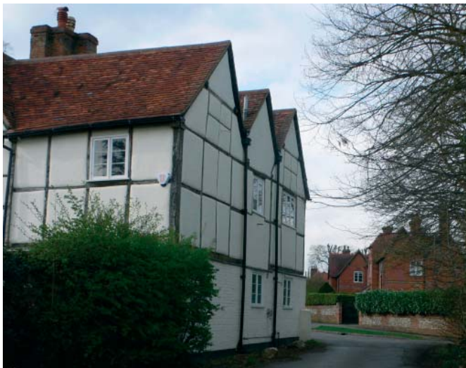
A number of historic houses are built along the Thames. Red brick and brick and flint are common materials with some white render and timber.