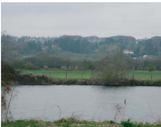
Tranquil area of meadow and farmland adjacent to the River Thames.