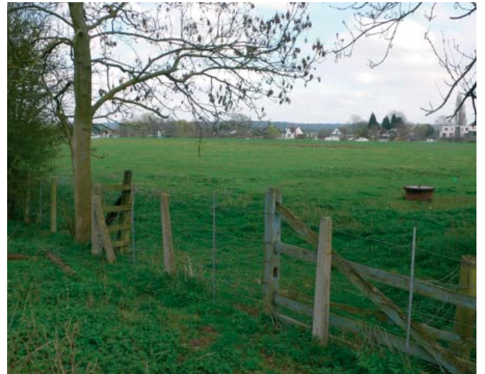
A flat, low lying floodplain with long views. Fields of arable farmland pasture and rough grazing are divided by wooden post and rail fencing and hedgerows.