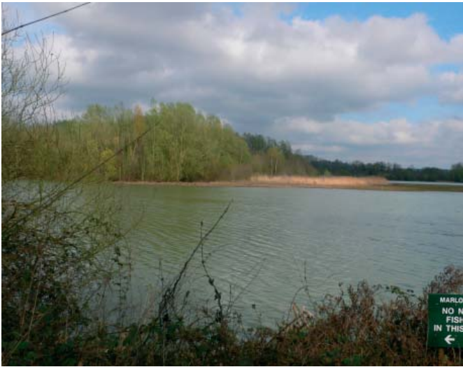
Gravel-pit lakes at Spade Oak, with wet woodland and wet meadows.