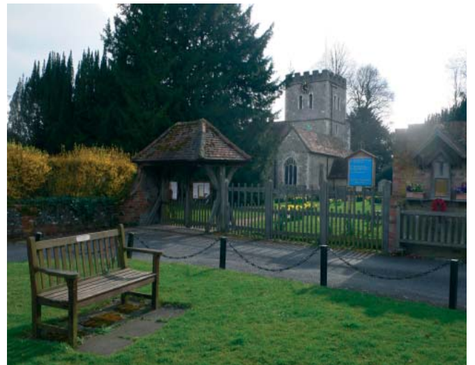
St John the Baptist Church at Little Marlow, with a strong historic character.