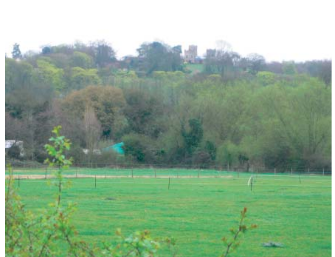
Important views from the floodplain to higher wooded slopes and Hedsor Priory.