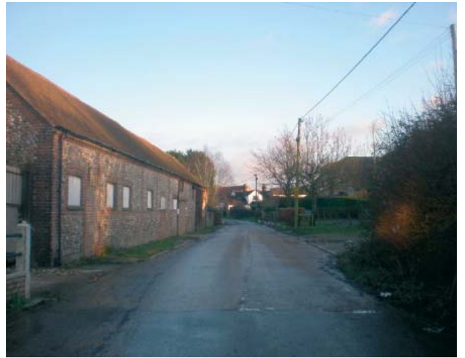
Settlement edge of Great Kingshill, vernacular brick and flint buildings.