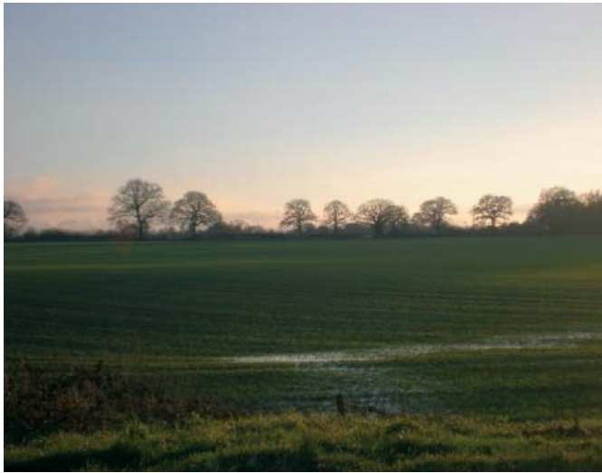
Plateau landscape, open views across fields, which are delineated by hedgerows and scattered trees.