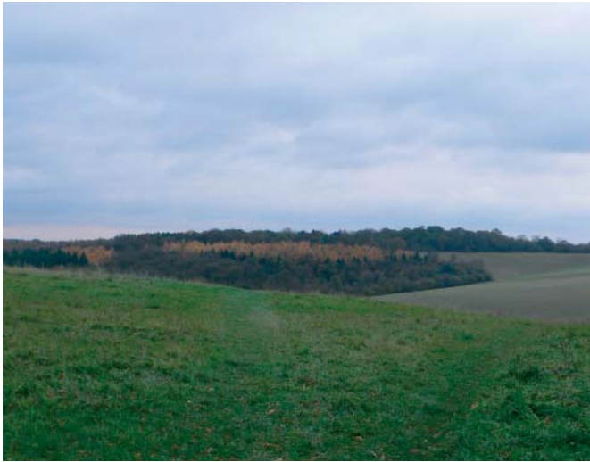
Mixed woodland blocks, creates a rich variety of colours and textures.