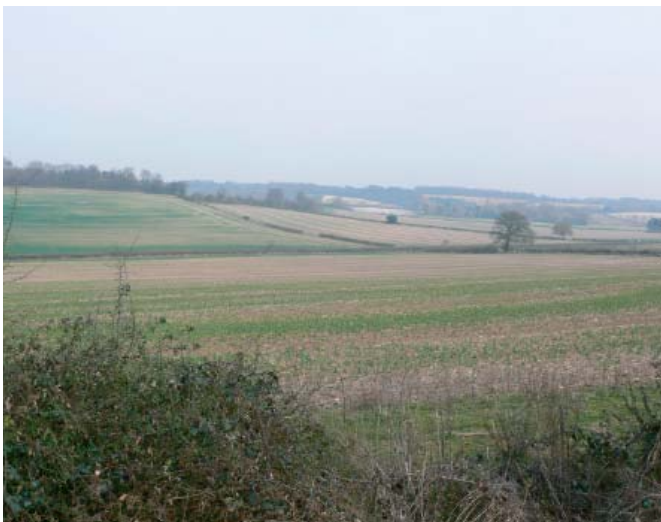
Large scale undulating landform near Chequers.