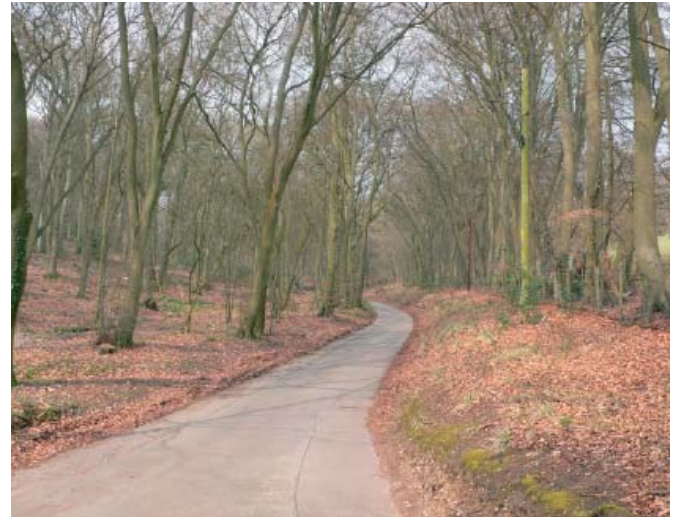
Winding rural lanes enclosed by woodland.