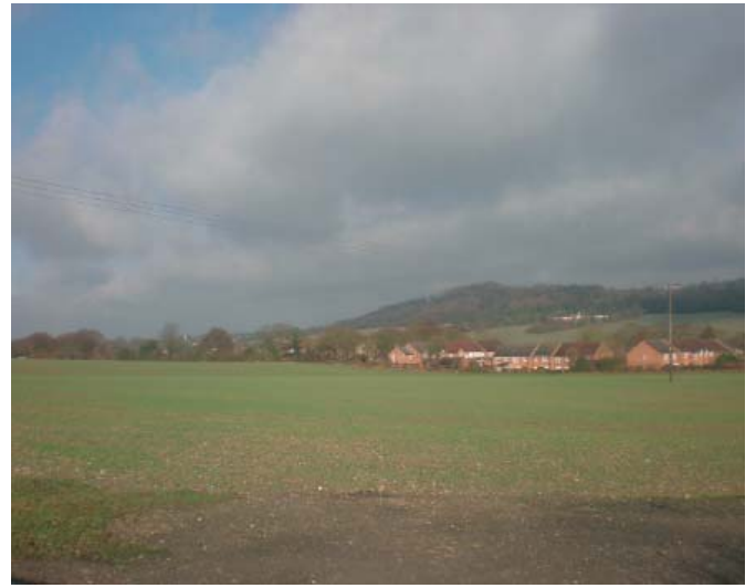
Settlement occurs linearly along the valley floor.