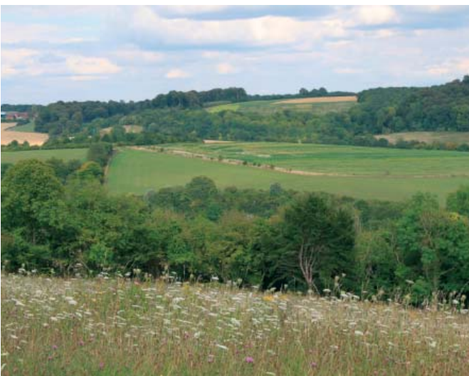
Extensive view from West Wycombe Hill.