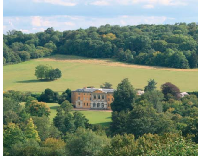
West Wycombe House and surrounding parkland landscape.