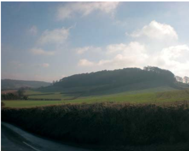
Rolling chalk valley sides, dominated by arable farmland often extending down in to the valley bottom. Wooded tops create a strong visual boundary.