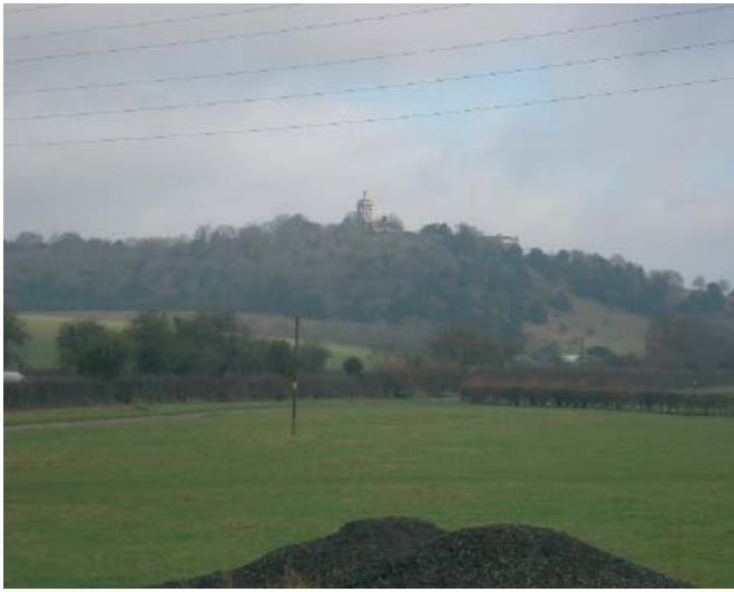
Important views to the Church and Mausoleum at West Wycombe.