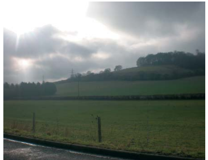
Wide floodplain and gently sloping valley side, becoming progressively steeper. Pylon line passing through the landscape.