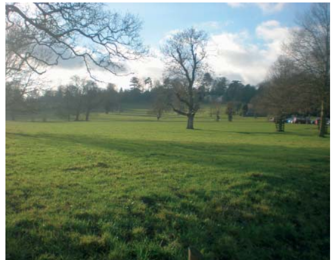
Historic parkland, with scattered trees at Hughenden Manor.