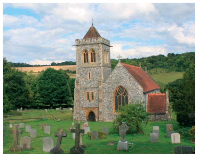
Traditional materials include brick, flint and red slate, such as at St Michael and All Angels Church at Hughenden Manor.