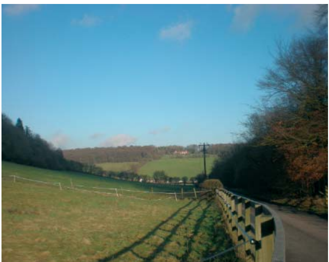
Quiet rural roads wind up the valley sides, often contained or partly enclosed by woodland.