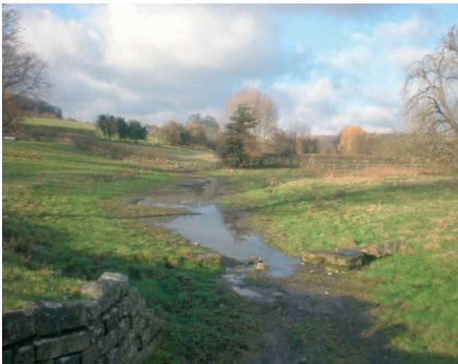
The Hughenden Stream meanders through the broad, lower chalk valley, flowing through Hughenden Park.