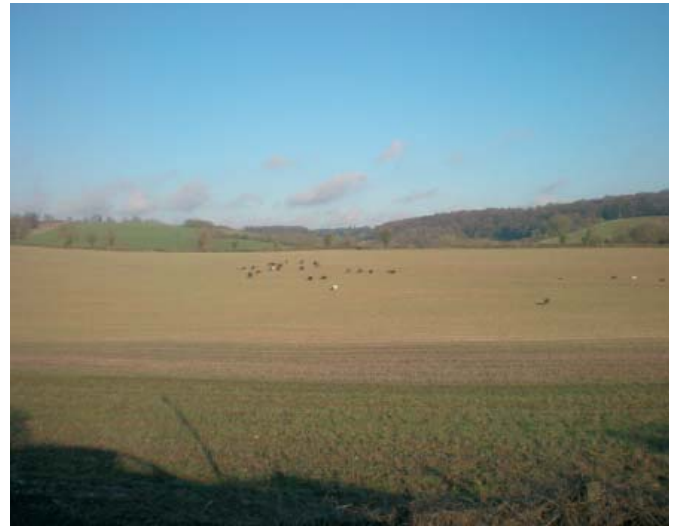
Arable and pastoral fields dominate valley sides, with long views up and down the valley sides.