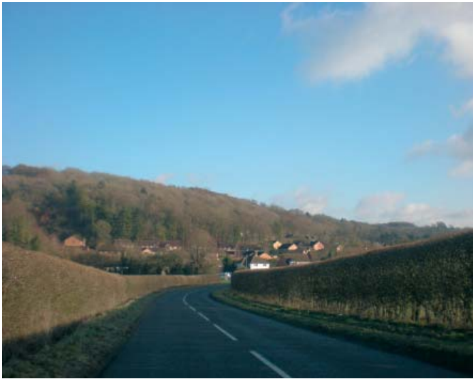
Hughenden Valley village is nestled within the valley floor.