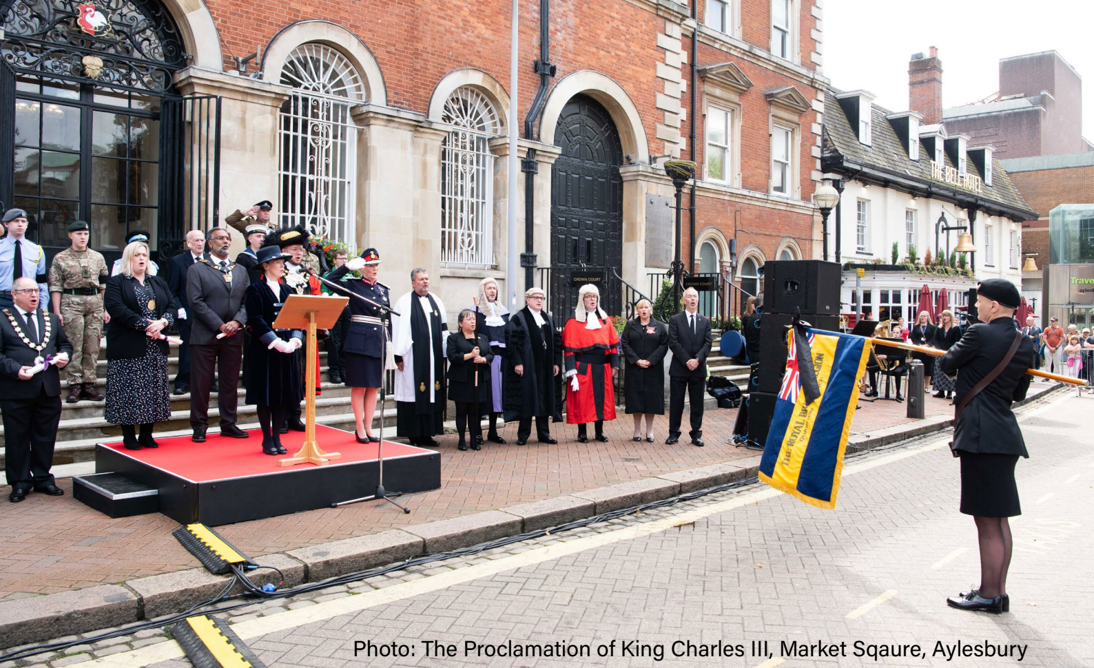
Photo: The Proclamation of King Charles III, Market Sqaure, Aylesbury