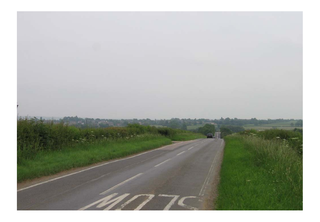
Rolling landform northwest of Newton Longville looking south east along Whaddon Road.