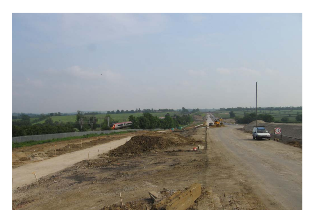
Construction of the Stoke Hammond Bypass, west of the mainline railway.