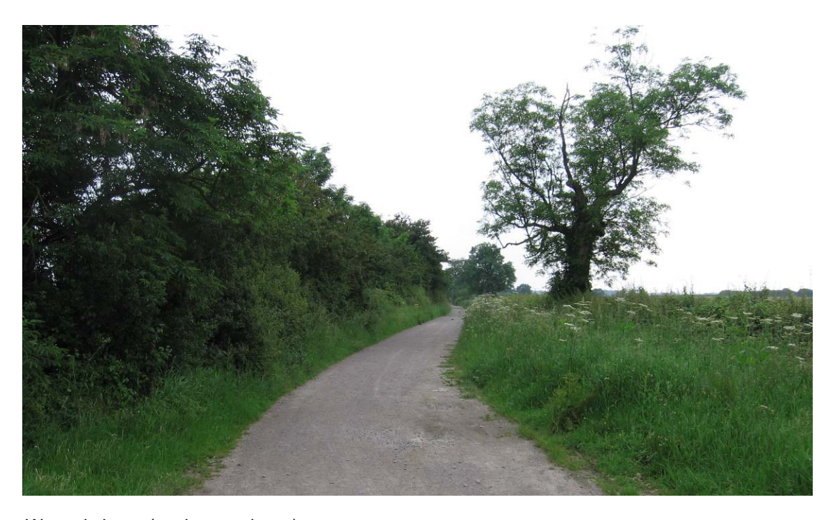
Weasels Lane (ancient trackway)

The area retains its local distinctiveness however, continuity is disrupted. Strength of character is considered to be weak. The degree of visibility is moderate as this varies with the undulating landform and the general lack of tree cover. Overall the degree of sensitivity remains low.