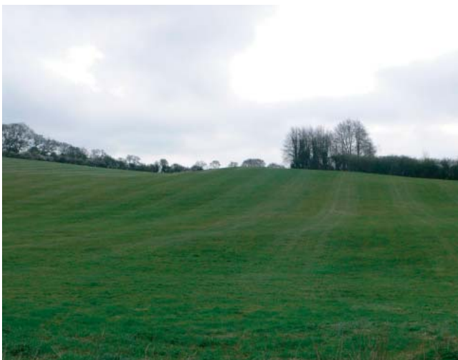
Convex farmland slopes.