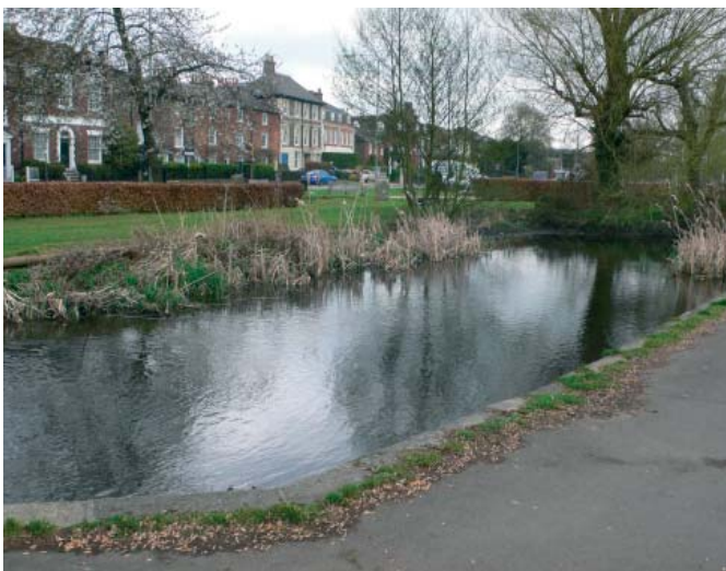
The River Wye flows through The Rye open space, one of the few places where it is a prominent feature in this landscape.