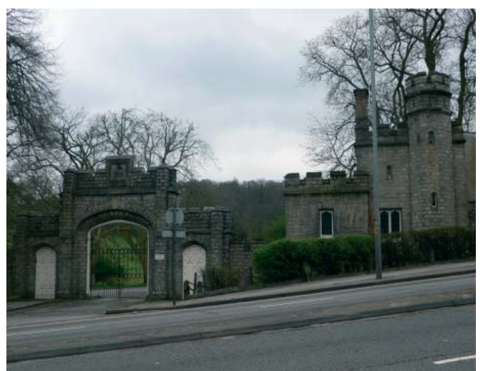
Entrance to historic parkland at Wycombe Abbey.