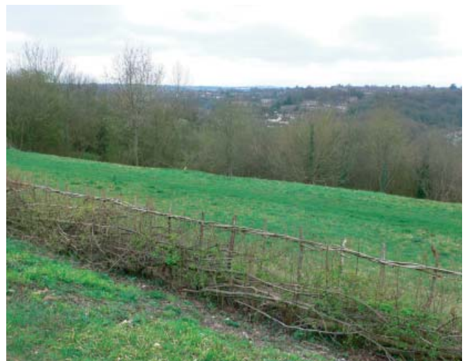
Significant blocks of woodland contain High Wycombe on upper valley slopes.