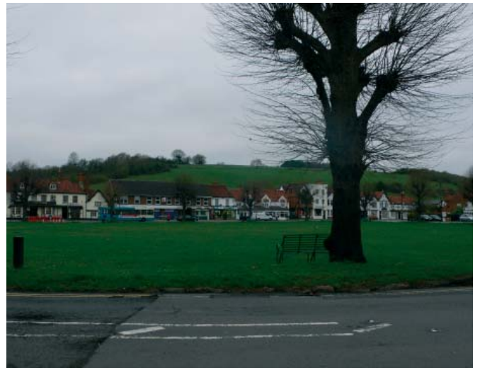
A mix of modern and some historic vernacular buildings in the valley bottom with open valley slope backdrop.