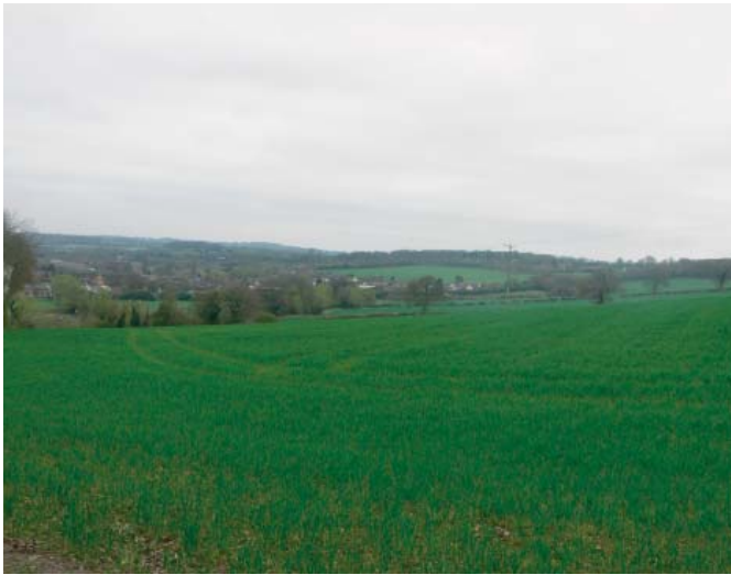
Rural farmland valley slopes with settled valley floor.