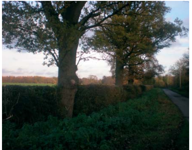
Small, winding rural roads, lined by trees and hedgerows, providing a sense of enclosure.