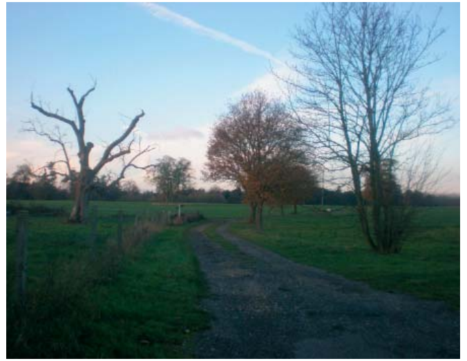
Hall Barn - Historic parkland, open grassland with scattered trees, and woodland blocks in the distance.