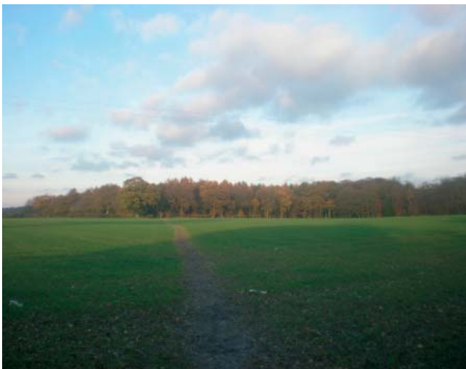
Long views, with woodland block backdrop.