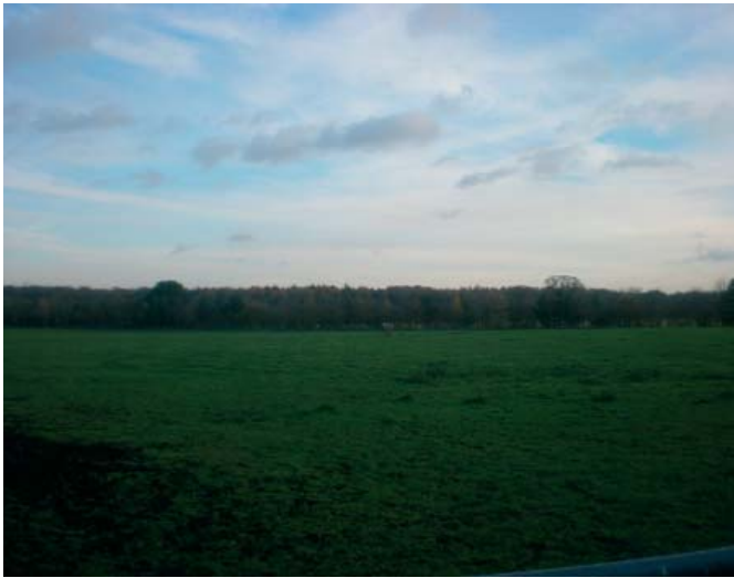
Large scale, open, flat arable fields.