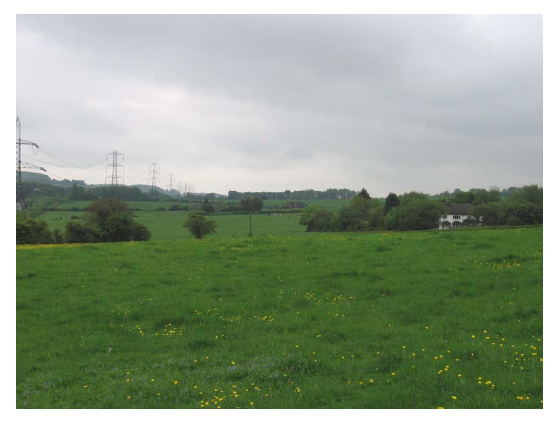
Looking south - the pylons follow the valley bottom.