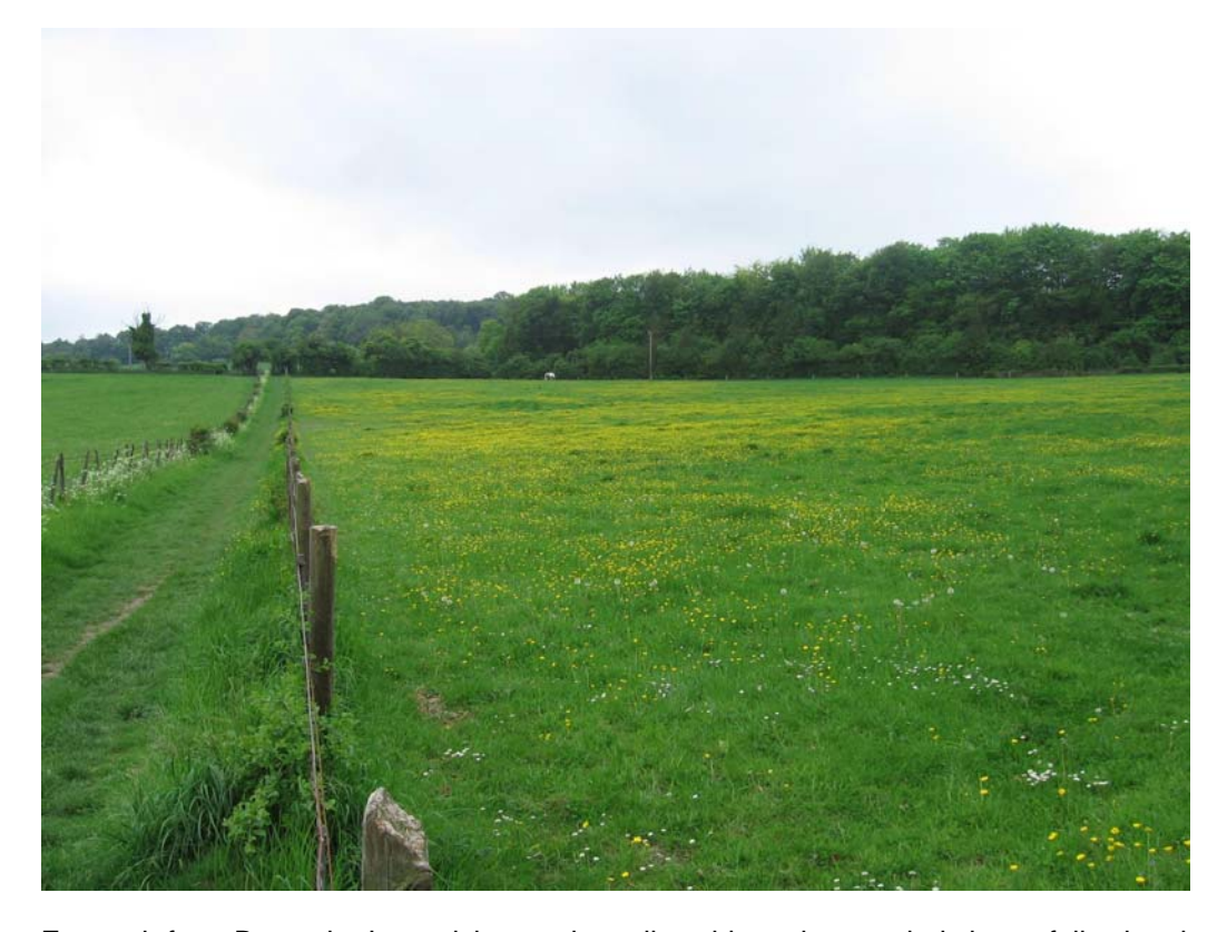
Footpath from Bacombe Lane rising up the valley side to the wooded slopes following the valley crest.