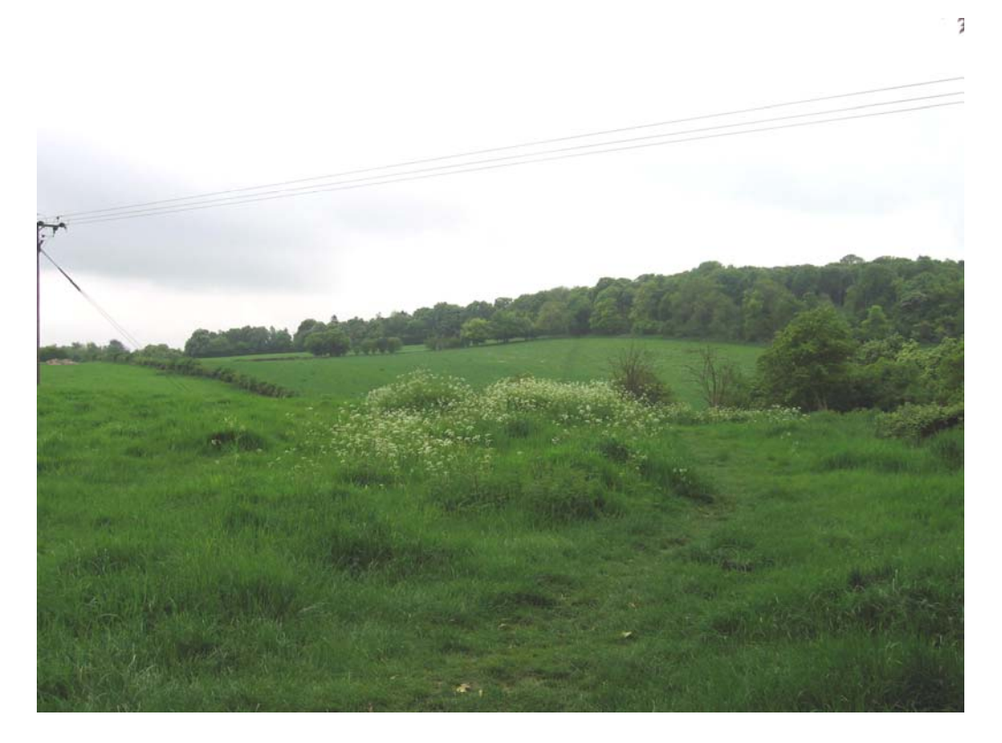
Gently rolling landform on the western valley edge.