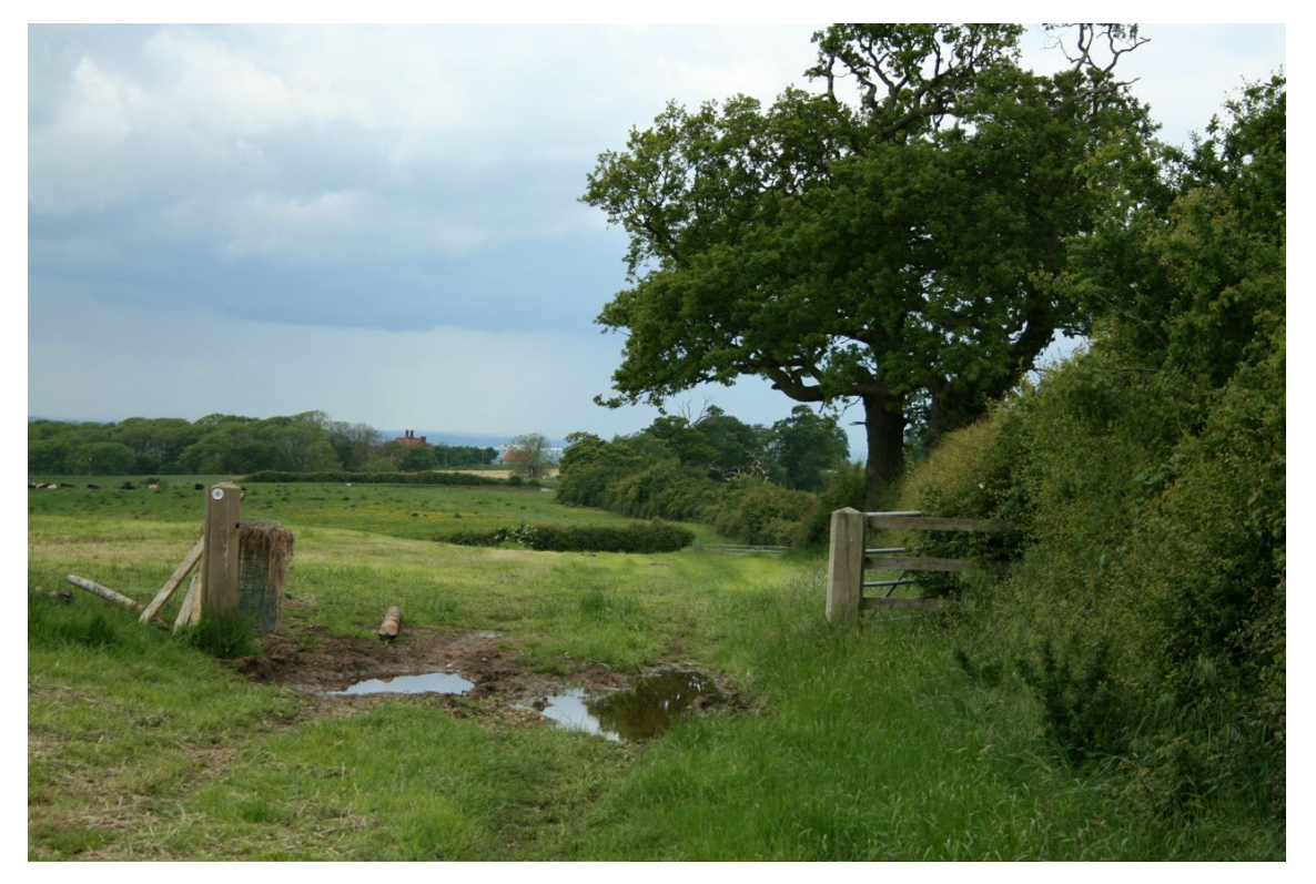
The hill is well served by bridleways and footpaths.