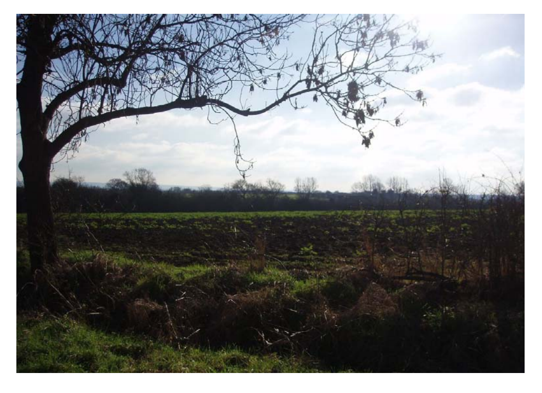
Close to Peppershill Farm there are some notable small fields of arable with strong hedgerows.