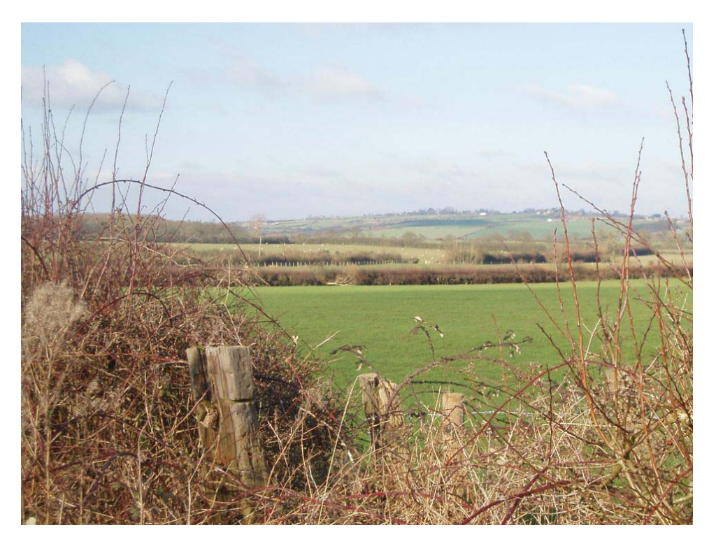
The landscape character of this area is variable and often enclosed by high hedgerows - this more open view looks out towards Brill Hill.