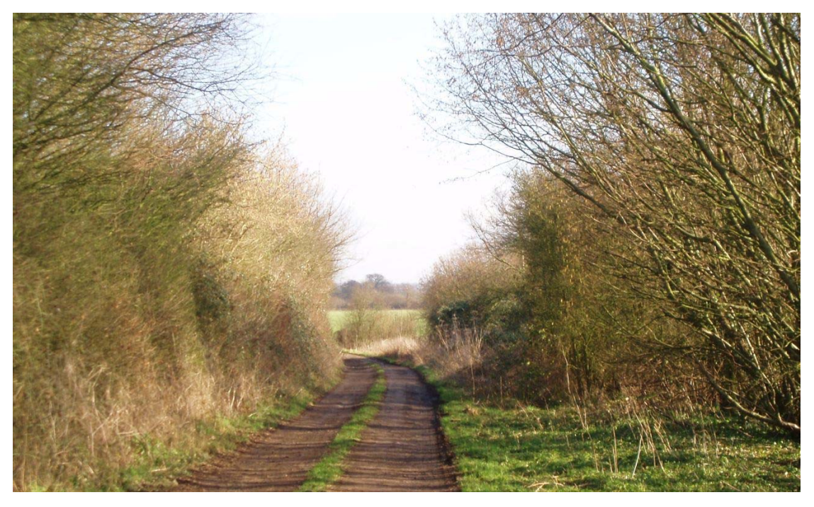
The area is crossed by a good network of footpaths and bridleways. These are often bounded by high hedgerows

The landscape has a distinct character and good sense of historic continuity from the historic hedgerow pattern and bridleways. Overall the area is considered to have a moderate sense of place. The landform is apparent but not a dominant part of the landscape character. The tree cover is considered to be intermittent reflecting the low level of woodland cover but some areas with good hedgerow trees. This gives a moderate level of visibility. Overall the sensitivity of the landscape is considered to be moderate.