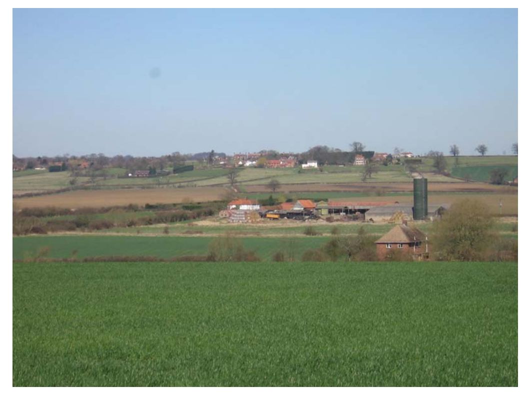
The Vale seen from the Bierton Ridge above Grendon Hill Farm. The flatter vale lies between the Bierton Ridge and the Weedon Ridge to the north.