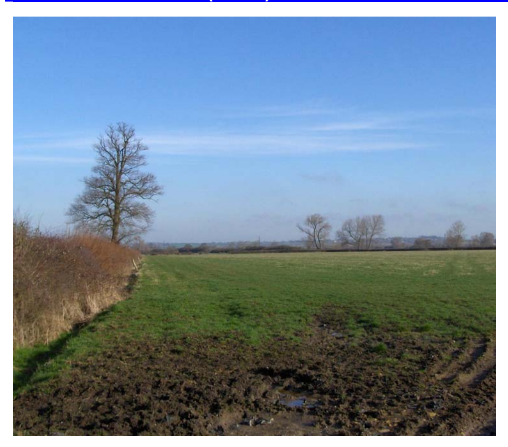
Remote low lying vale landscape in pastoral use north of College Road and extending beyond the district boundary.