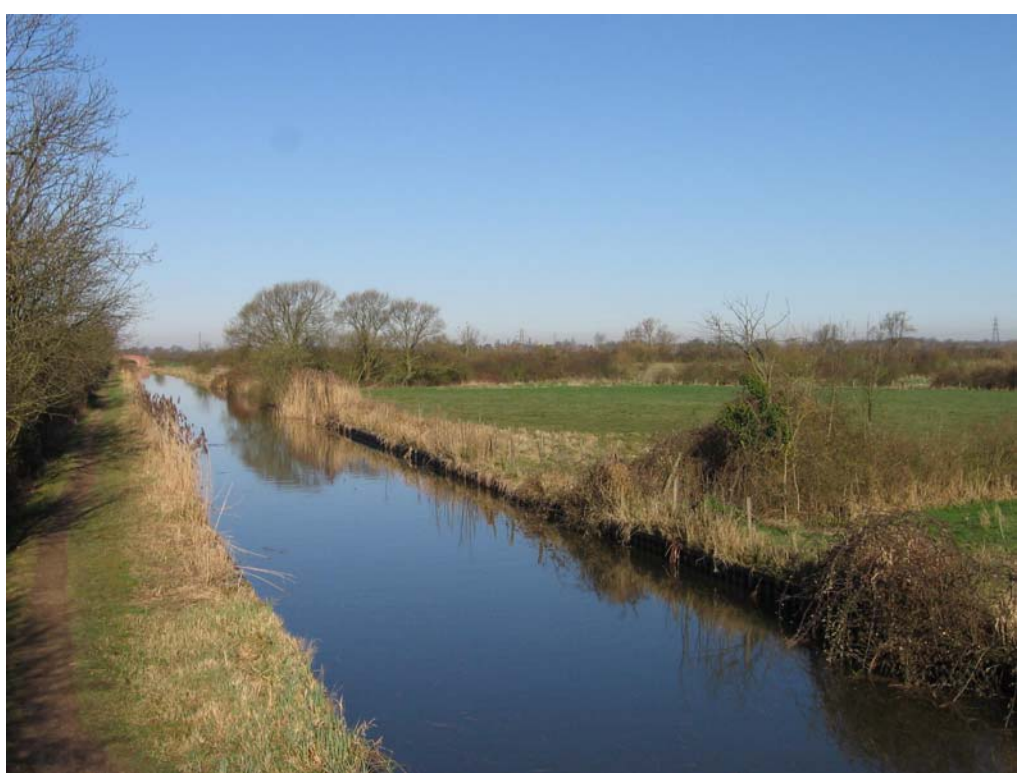
The Aylesbury Arm of the Grand Union Canal forms the southern boundary of the LCA. The canal towpath is one of the few public viewpoints to the Hulcott Fields LCA seen here to the right.

The landscape is distinctive in character and the historic associations are reasonably well expressed in the field patterns and drainage networks. Overall the sense of place is moderate. The topography is insignificant due to the flat character of the Vale which, combined with the intermittent nature of the tree cover and concentration of hedgerows gives a low degree of visibility. Overall the sensitivity of the landscape is low.