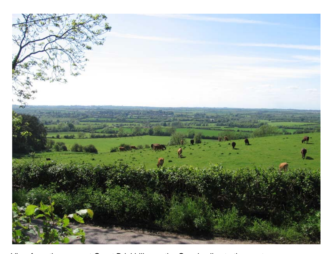
View from the scarp at Great Brickhill over the Ouzel valley to the west.