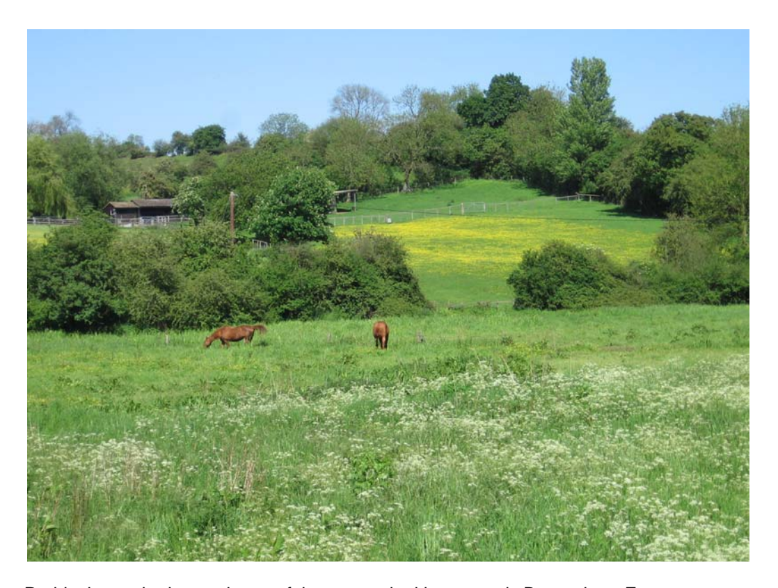
Paddocks on the lower slopes of the scarp - looking towards Bragenham Farm.