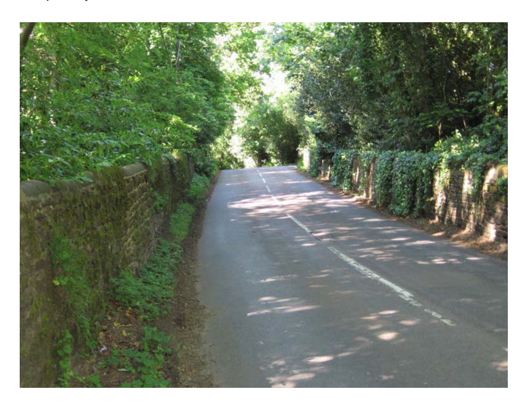
Galley Lane north of Great Brickhill. Parkland enclosed by stone wall.