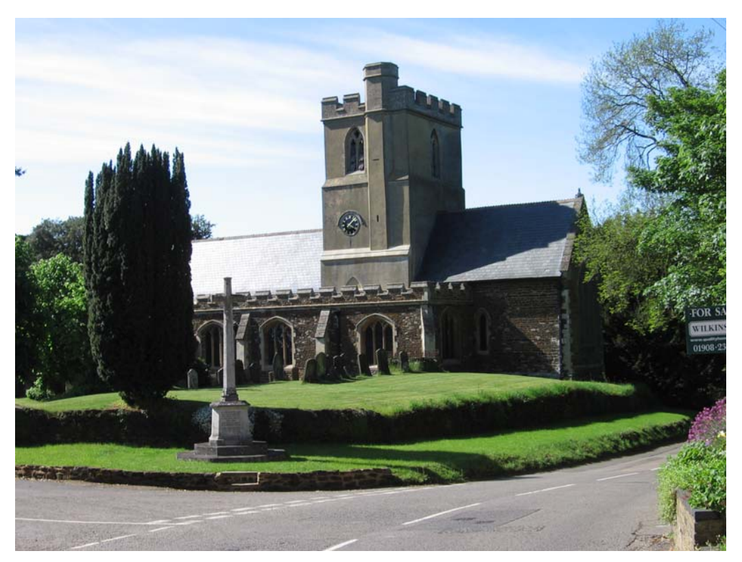
Great Brickhill Parish Church.

The area is identified as a distinctive landscape which dominates the surrounding areas to north and west. Historic continuity is supported by moderate sense of place. The dominant landform is supported by strong woodland cover around the settlement and forms a strong backdrop to the east of the area. Lower slopes are in agricultural land use and this gives an overall rating of intermittent tree cover. Due to the elevated nature of the scarp there are long distance views over the Ouzel Valley to the west and to the north.