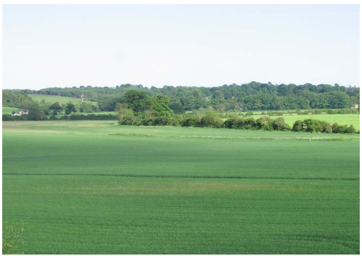
View of Brickhills Scarp from the A4146 Galley Lane.

LCA 6.1 Brickhills Scarp LCA 6.2 Stockgrove Wooded Slopes