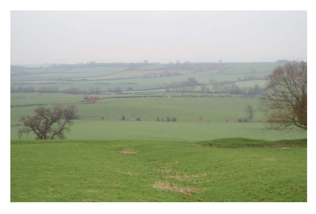
The lower ground is part of the southern most part of the area, which is inaccessible by road and has a slightly remote character. The best tree cover can be seen adjacent to the streamline.