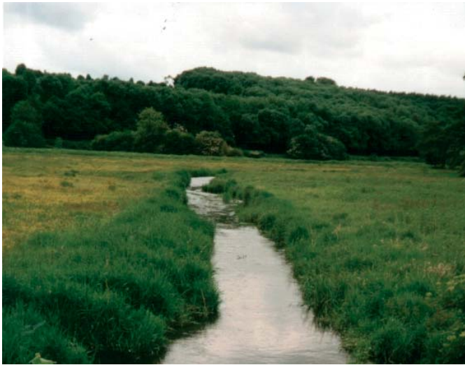
River Misbourne flowing through wetland meadows.