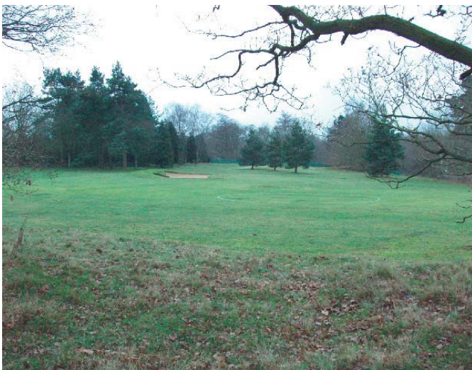
Chalfont Park golf course.