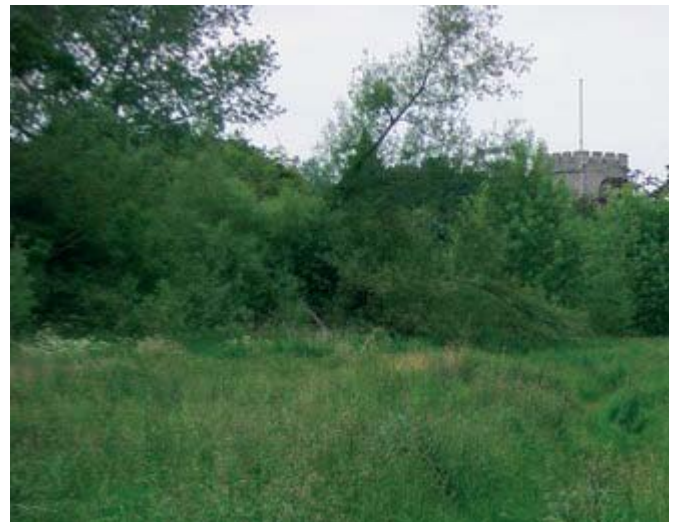
South Bucks Way looking towards to Chalfont St Giles Church.

© Copyright Shaun Ferguson and licensed for reuse under this Creative Commons Licence