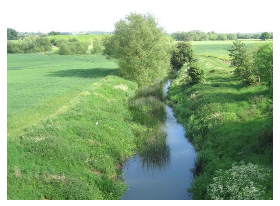
River Ouzel looking south from the A4146.