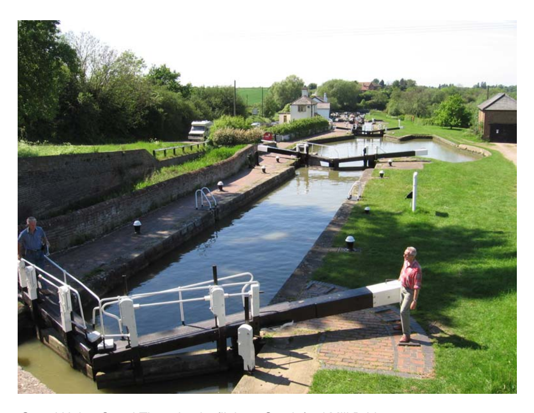
Grand Union Canal Three Locks flight at Stapleford Mill Bridge.