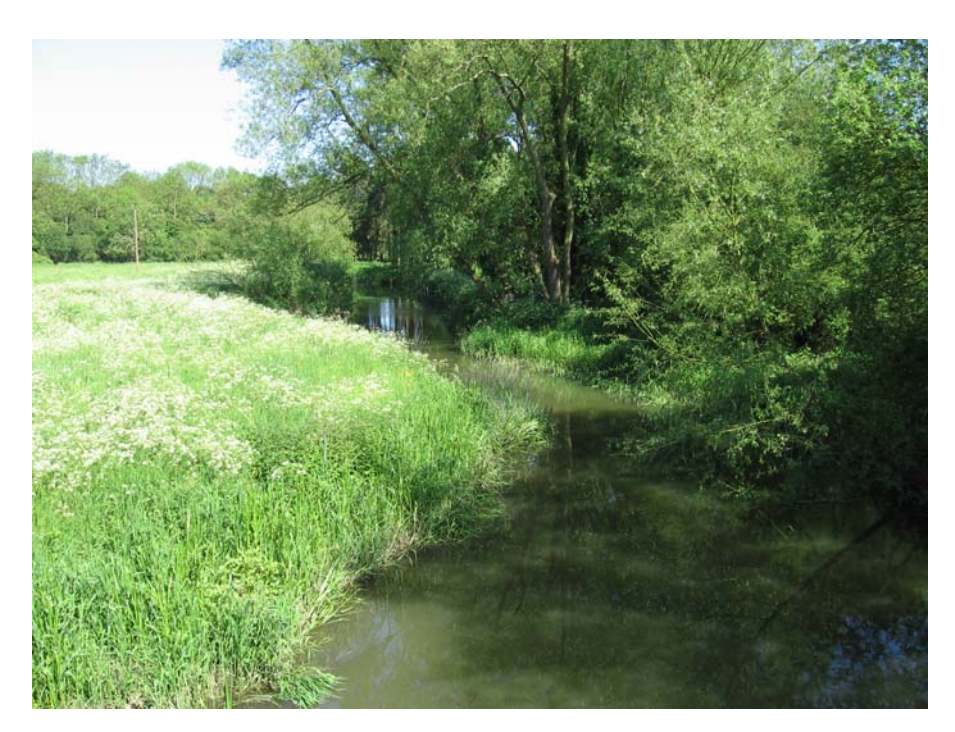
Mature vegetation along the River Ouzel looking south from Stapleford Mill Bridge.