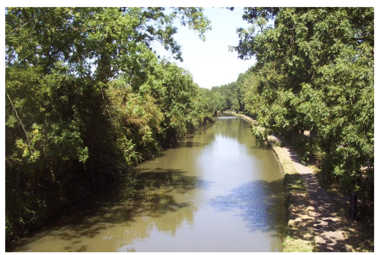
The Grand Union Canal is often hidden by bank side vegetation.

The area is distinguished by the character of the river and canal corridors. There is a strong historic continuity in these features. Overall the area has moderate sense of place. The landform of the valley is apparent becoming a more dominant feature of the landscape beyond the area. The degree of visibility is considered to be low primarily due to the mature tree cover in the valley bottom. This dissipates over the upper slopes. Overall the degree of sensitivity remains low.