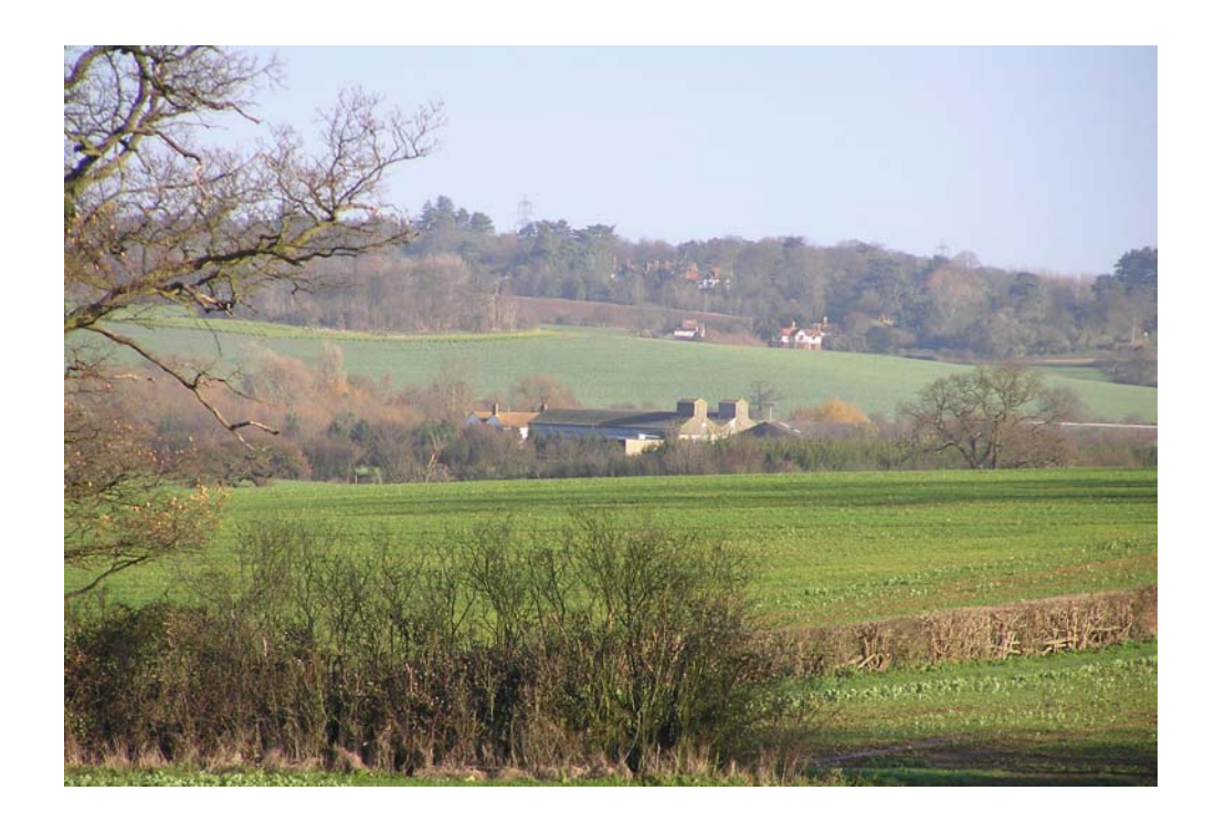
Looking northwest from Wingrave toward the Cublington to Wingrave Road. The A418 runs in a shallow valley in the middle distance