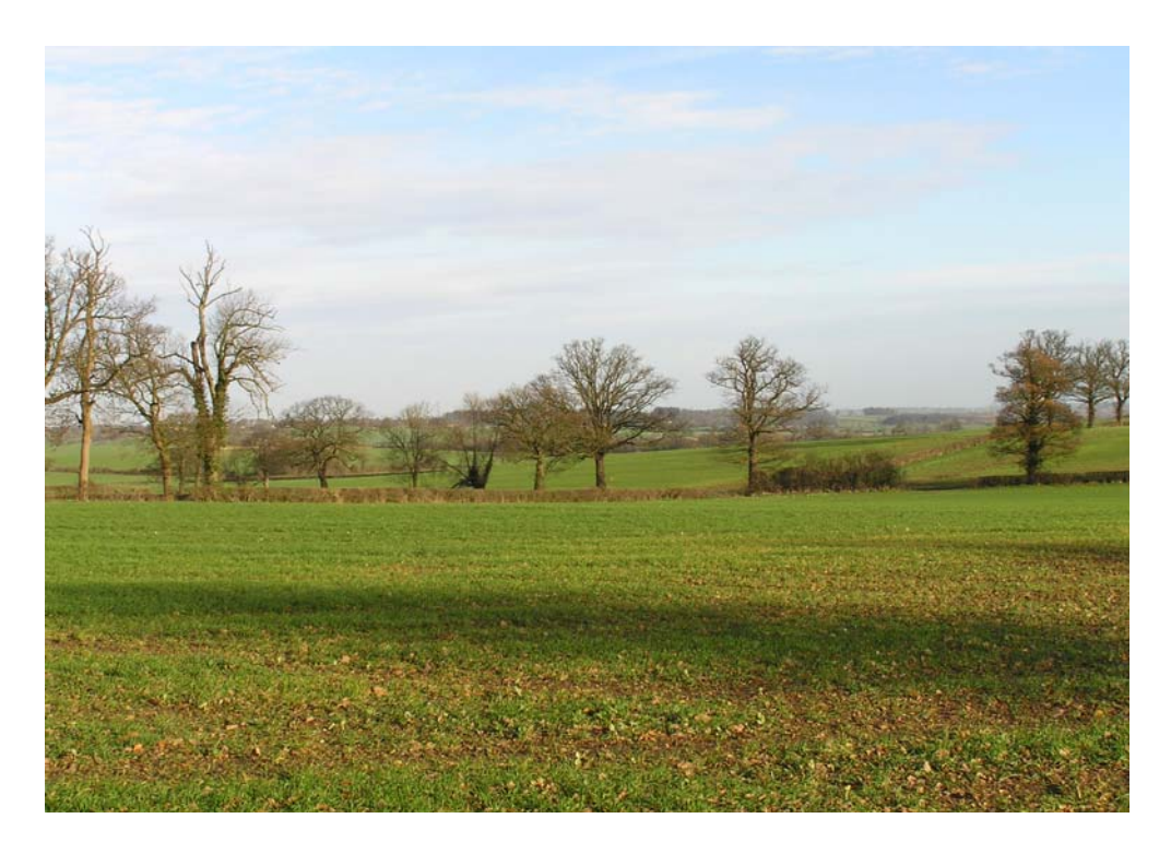
Looking north from Wingrave over rolling farmland.