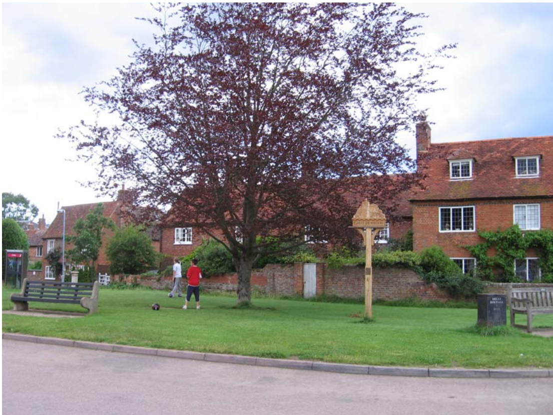
The Village Green at Great Horwood.

The area maintains its distinctiveness due to its intrinsic rural characteristics and the historic continuity of the area. Sense of place is considered to be moderate. The degree of visibility is moderate as this varies with the undulating landform and intermittent nature of the tree cover. Overall the degree of sensitivity remains moderate.