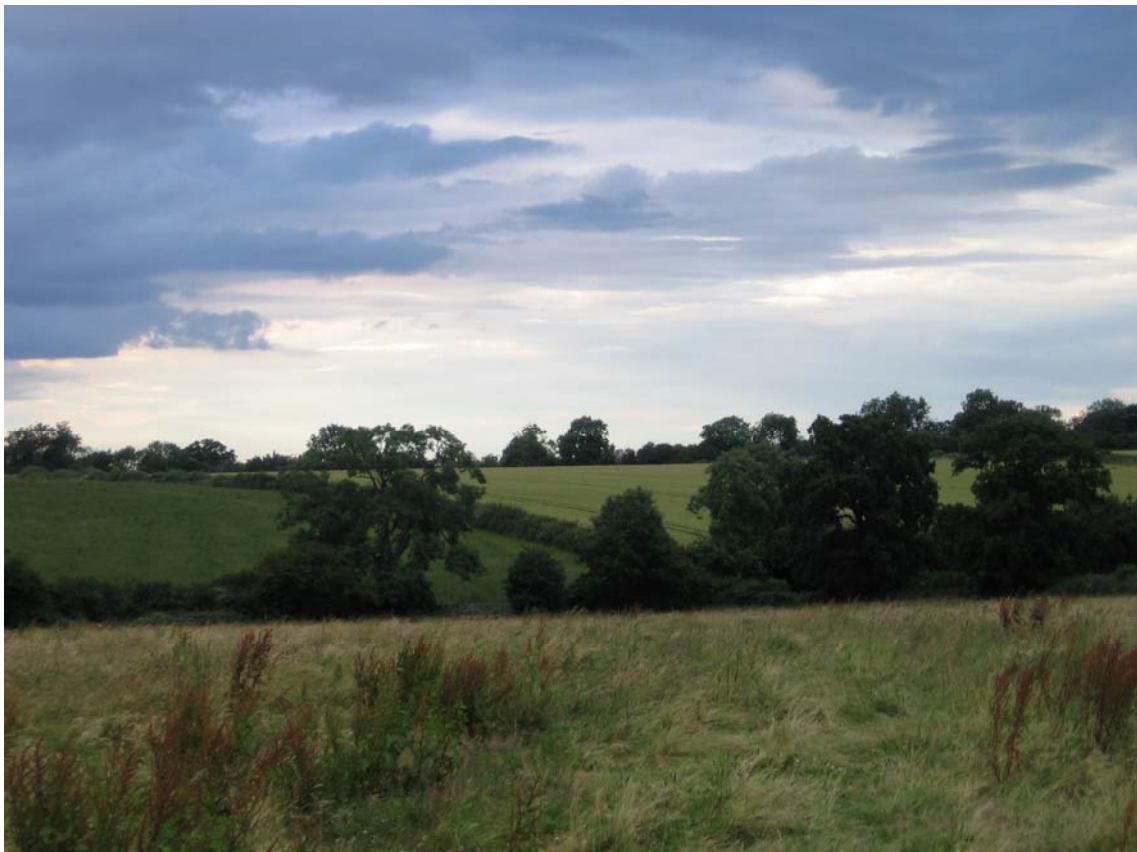
Shallow valley between the Little Horwood roundabout and the A421.