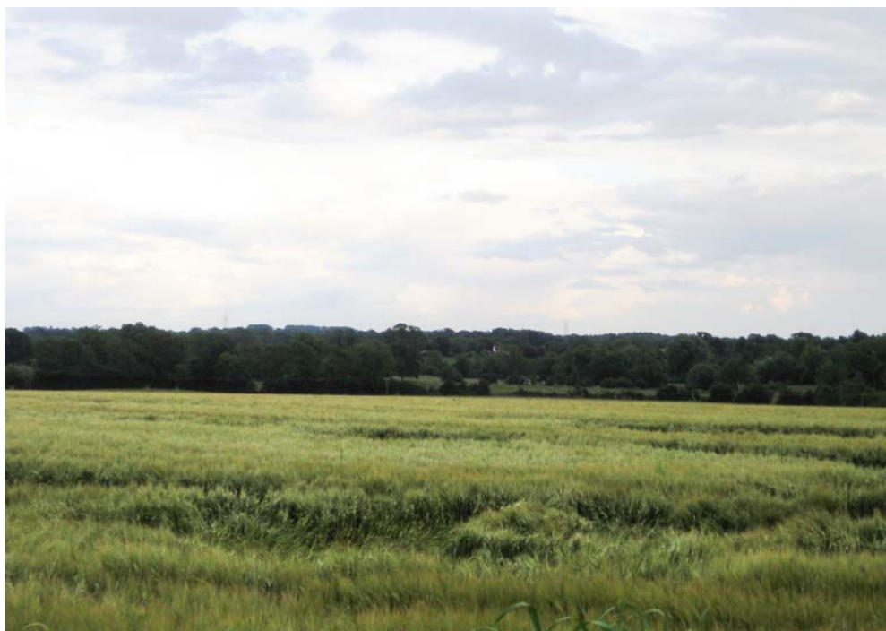
View from the Little Horwood Road. Little Horwood village is hidden behind mature hedgerow trees.