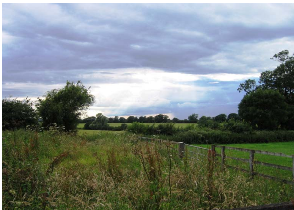
Shallow pastoral valley north of Little Horwood.