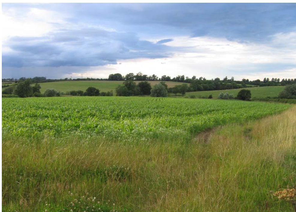
Shallow clay valley with small arable field, south of the A421 and west of Great Horwood.