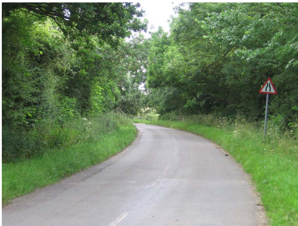
Thornborough Road. Narrow winding lane with mature tree cover.