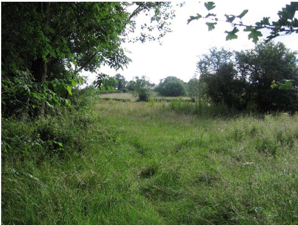
Small parcels of pasture south of Nash.

The area has retained its distinctiveness with an emphasis on historic continuity particularly in the north of the area. Sense of place is moderate. The landform of the ridge and local valleys that drain off the ridge are an apparent feature where the elevation permits longer distance views over the area. However, visibility is variable due to the intermittent maturity and extent of tree and hedgerow cover.