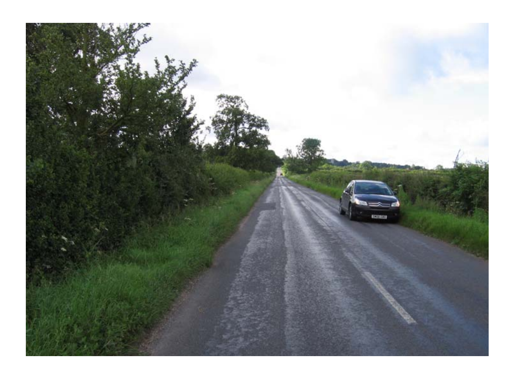
Distinctive straight alignment of Stratford Road, looking towards Whaddon.