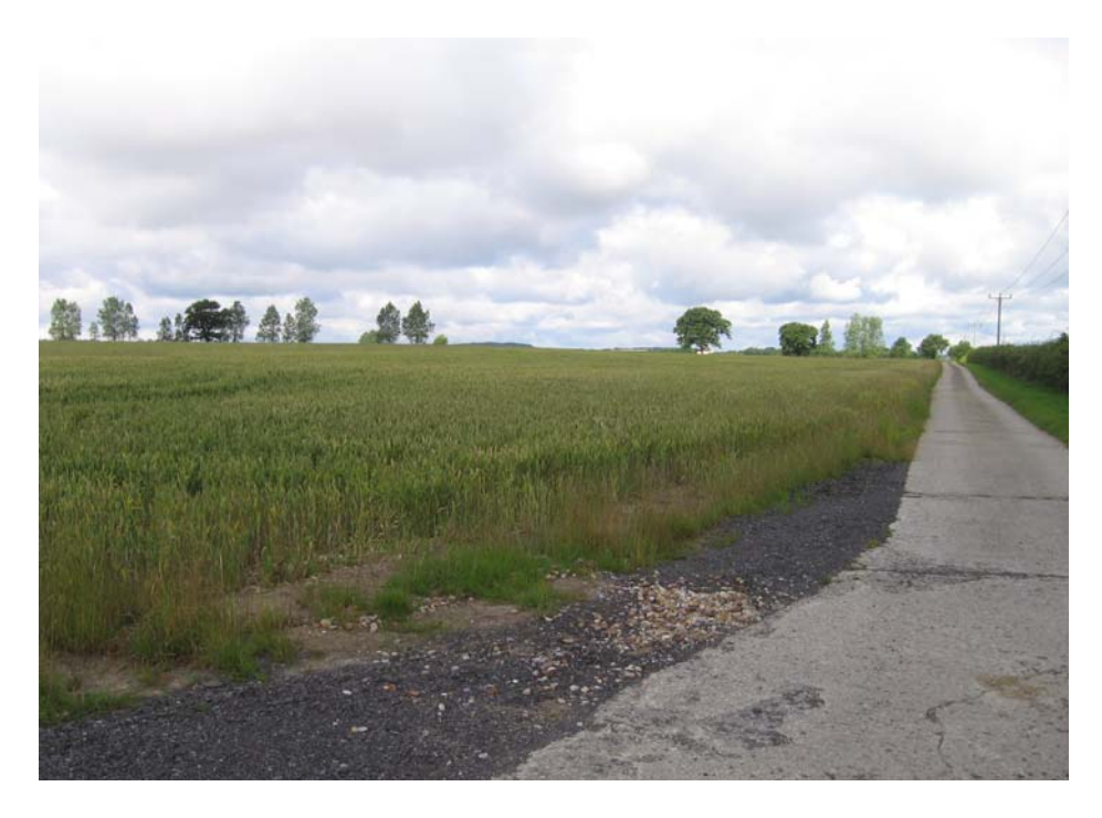
Looking west over arable fields from the Stratford Road.