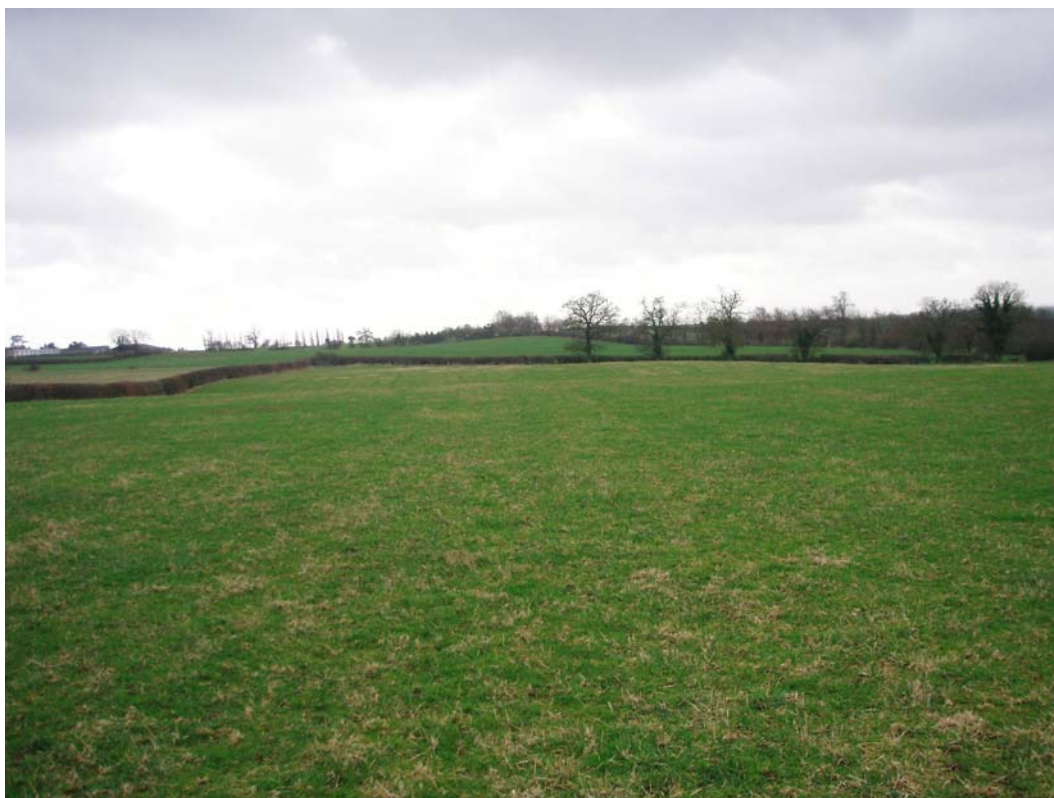
View towards Castle Fields Farm south of Chackmore.