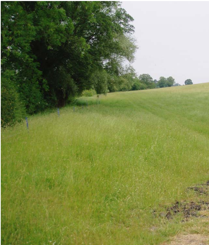
Strong line of trees and shrub adjacent to a stream, north of the A422.