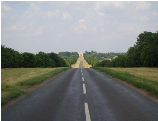
View down the Stowe Avenue to the Corinthian Arch.

Overall this is considered to be a moderately sensitive landscape. It has a distinct landscape character and a good sense of historic continuity even away from the Stowe Avenue the field pattern is strong and there are many features such as the historic village of Chackmore and the parkland trees around Castle Fields that give strong historic associations. The gently rolling landform and the intermittent tree cover combine to give the area a moderate level of visibility.