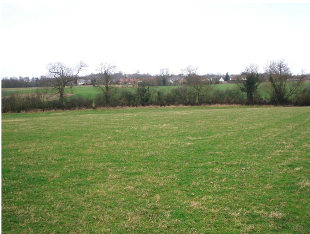
Looking towards Chackmore from the south.