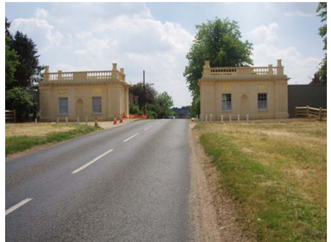
View of the lodges at the Buckingham end of the Stowe Avenue.