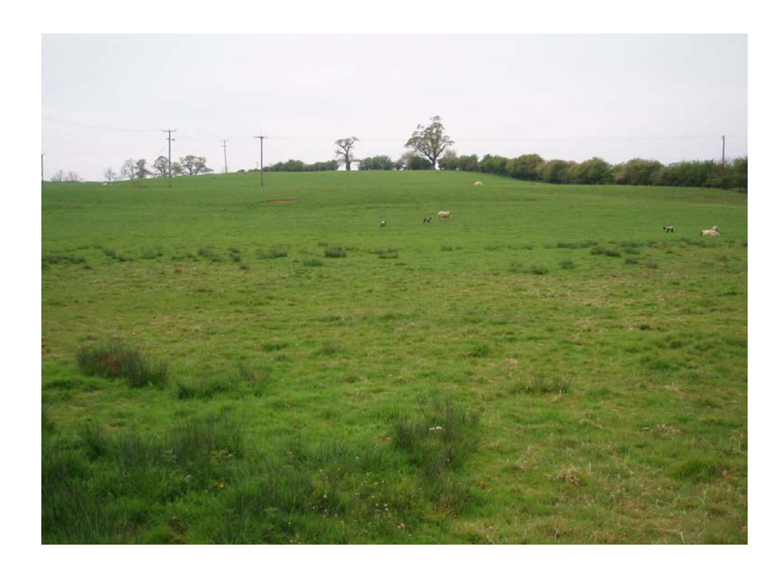
Typical example of pastoral land on gently sloping valley sides.