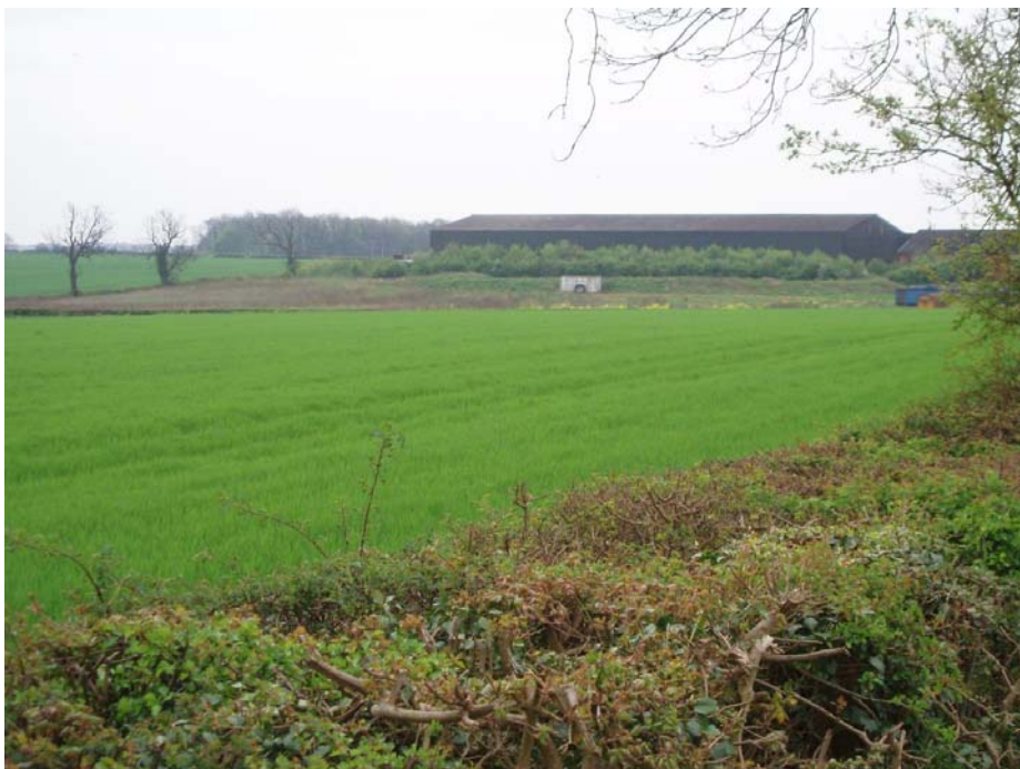
Grass drying plant to the north of Westbury - screen planting is starting to mitigate visual impact.

The area has a distinct character although this is weaker around the airfield. This distinct character creates a landscape which is assessed as having a moderate strength of character. The landform is apparent and the tree cover generally open, which gives the area a high level of visibility. The combination of the moderate sense of place and the high level of visibility combine to give this area a high level of sensitivity.