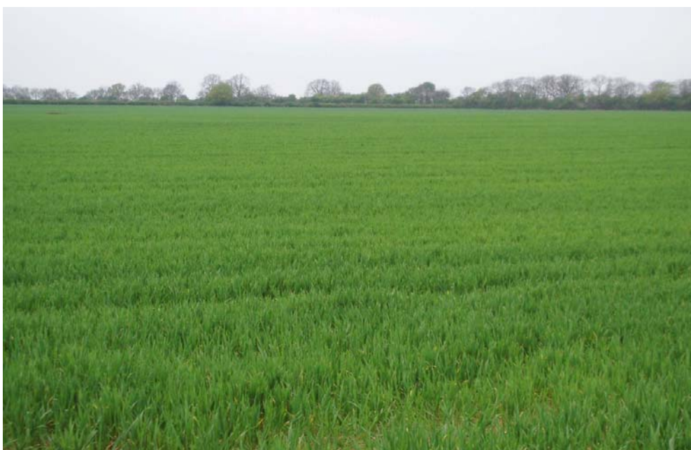
Arable field with woodland within Wood Green Wooded Farmland (LCA 1.3) to the right and trees along Ash Furlong Lane to the left.