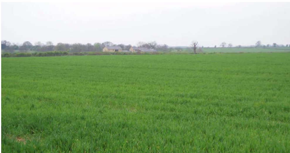
Open view looking south over the gently sloping plateau.