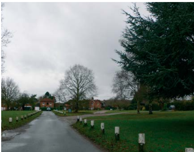
Red brick houses around village green at Bovingdon Green.