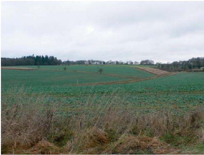
Rolling landform, arable fields interspersed with blocks of woodland.