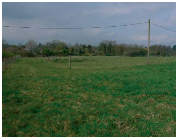
Smaller fields of rough grazing close to areas of settlement.