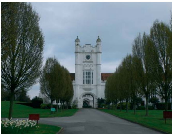
Danesfield House, set amongst formal gardens and overlooking the Thames.