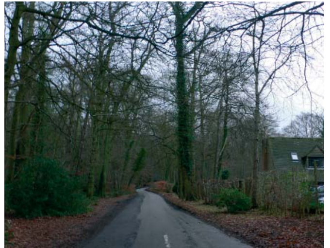
Enclosed rural lanes cross slopes.